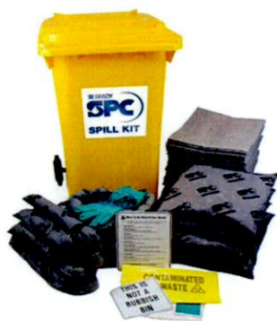
Figure 2.3 – Sample Spill Kit

The spill response procedure is as follows: