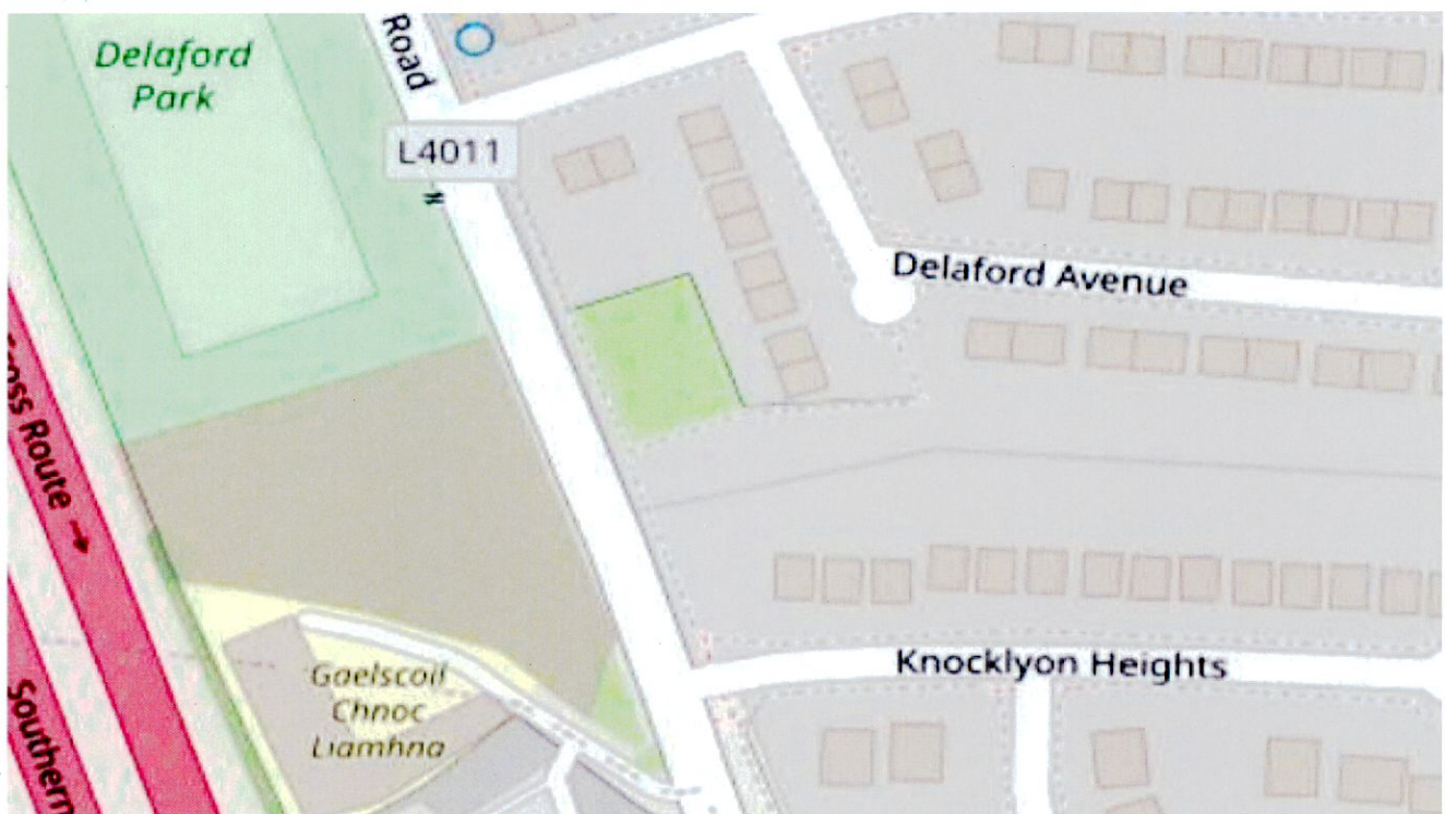
Figure 2.4 - Snapshot Showing No Watercourses.

It is the responsibility of the Site Manager to ensure that before any work commences that all potential environmental impacts have been identified and that all required permits and consents are received in writing. All requirements of the consent shall be met in full throughout the project and daily inspections are undertaken to review the water quality where applicable. There are no watercourses within 50m of the site (Figure 2.4). The nearest watercourse south of the site is approximately 290m from the nearest point on the site and this increases in the distance as it extends upstream.