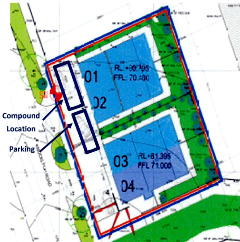
Figure 1.2 – Proposed Site Compound Location and Layout

The compound will be powered up by a competent electrician with approved materials and the installation signed off. All electrical equipment will be fit for purpose and inspected regularly. All heaters and cooking appliances i.e. microwave will be properly installed and adequate ventilation provided. Fire blankets will be provided with canteen facilities and drying rooms will be stocked with CO2 and dry powder extinguishers. Heaters will have a protective cover to ensure materials cannot come in contact with the element. The sanitary facilities for the construction workers will discharge to a sealed bunded temporary integrated storage area which will be extracted as required by a licensed contractor for disposal offsite at a licensed facility.