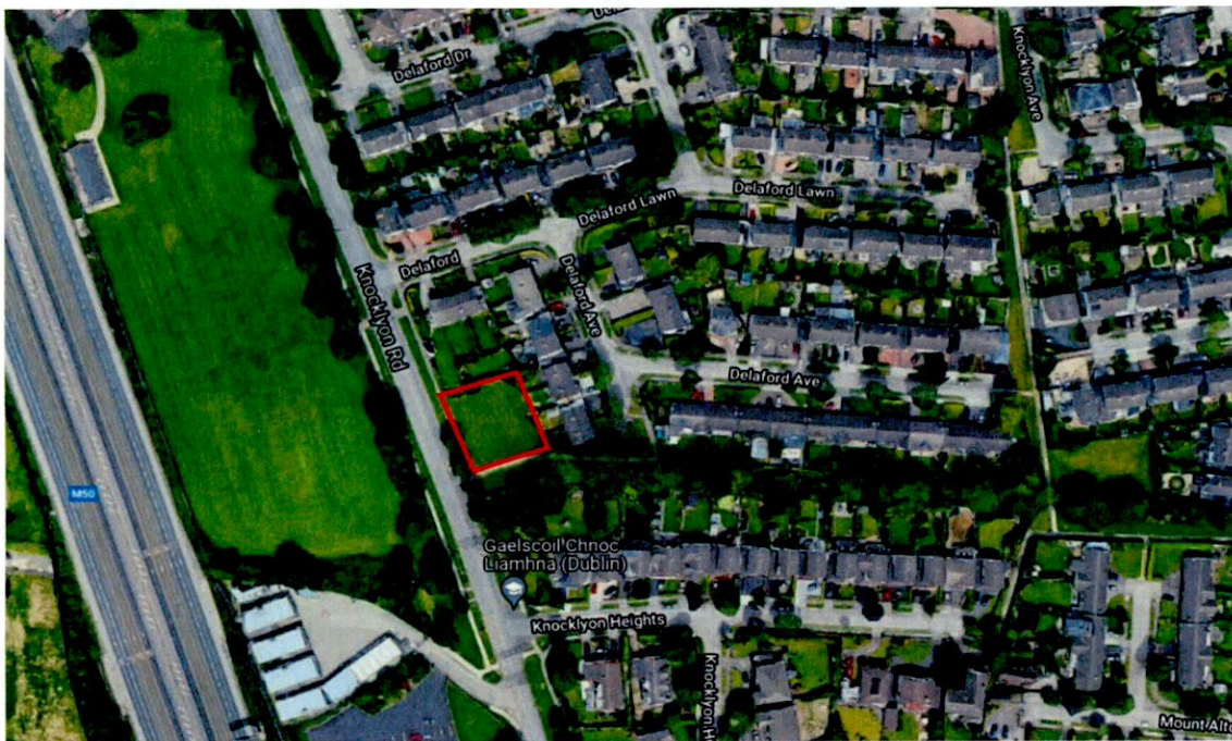
Figure 1.1 – Proposed Site Location. Site Outlined in Red.

Access to the site will be via the Knocklyon Road entrance. Any damage to adjacent public roads will be repaired and made good if damaged as a result of the works.