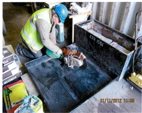
Figure 2.2 – Refueling Small Plant

Bunds shall hold 110% of the capacity of the tank and shall be enclosed to prevent rainwater from entering it (e.g. container of 1000 litres, requires a bund of at least 1100 litres). Rainwater would reduce capacity and creates the potential for disposal of contaminated water. The bund shall be impervious and sealed to prevent any seepage/leakage from occurring. The tank/bowser must be in good condition and be maintained. Regular checks are to be undertaken on the condition of the bund and tank. Outlet pipes shall be tied up and locked when not in use. Trigger nozzles shall be used and shall not be wedged open to aid dispensing.