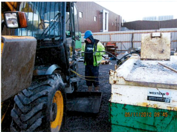
Figure 2.1 – Refueling Large Plant

All employees including subcontractors are to follow this instruction and to store, decant and handle substances in the manner stated. The Site Manager will record and report any incidents to the Safety & Environmental Manager. A minimum number of bulk containers and a minimum volume of substances should be stored on-site at any one time. A nominated person shall supervise all deliveries (and decanting) operations. Bulk containers (e.g. tanks and bowsers) shall be double skinned / banded. A designated refuelling area will be set up on-site. This is to be away from any site drains and out of the path of vehicles. Refuelling equipment will be fitted with a "Dead Man's Handle" which cuts off automatically and prevents overfilling.