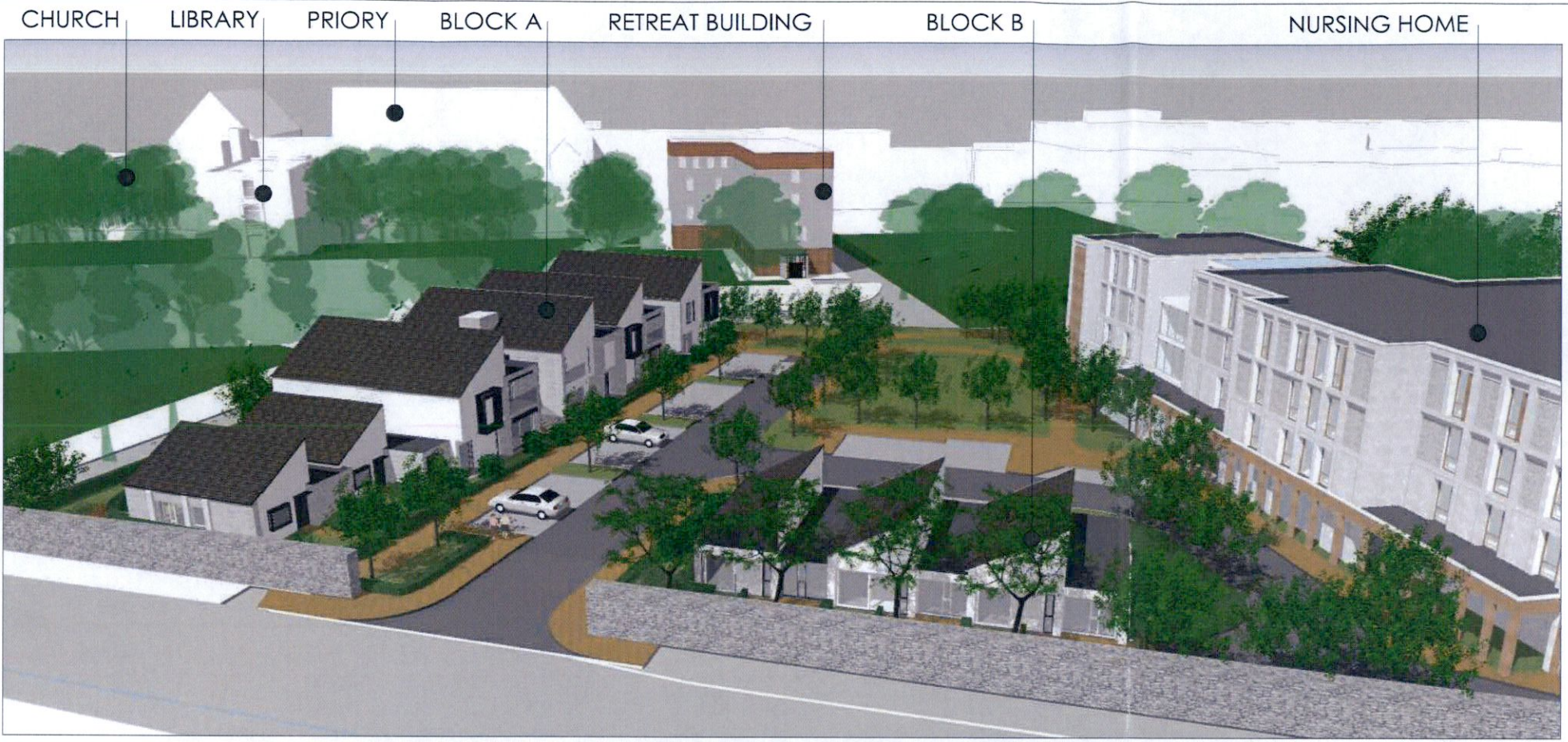
VIEW 1 OF SITE TAKEN FROM THE EASTERN BOUNDARY