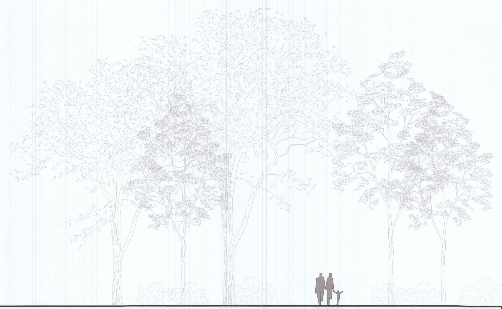
NURSING HOME SECTION A-A