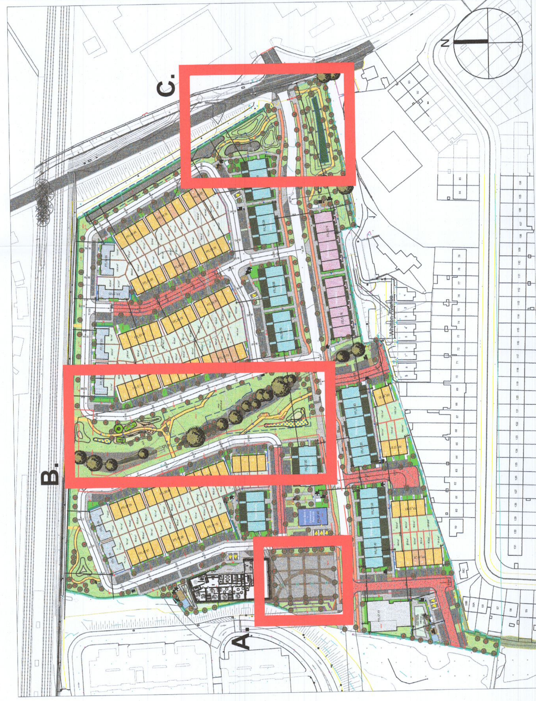
B. Central Open Space Detail