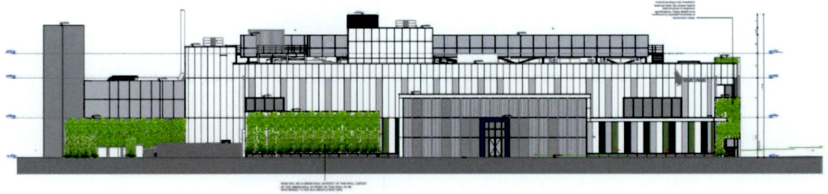
Figure 4: Proposed development facade design, ref.: Burns & McDonnell & Hyphen

There are five façade panel types that characterise the design concept – white and grey insulated clad sandwich panel, curtainwall, acoustic louvers and perforated metal panels.