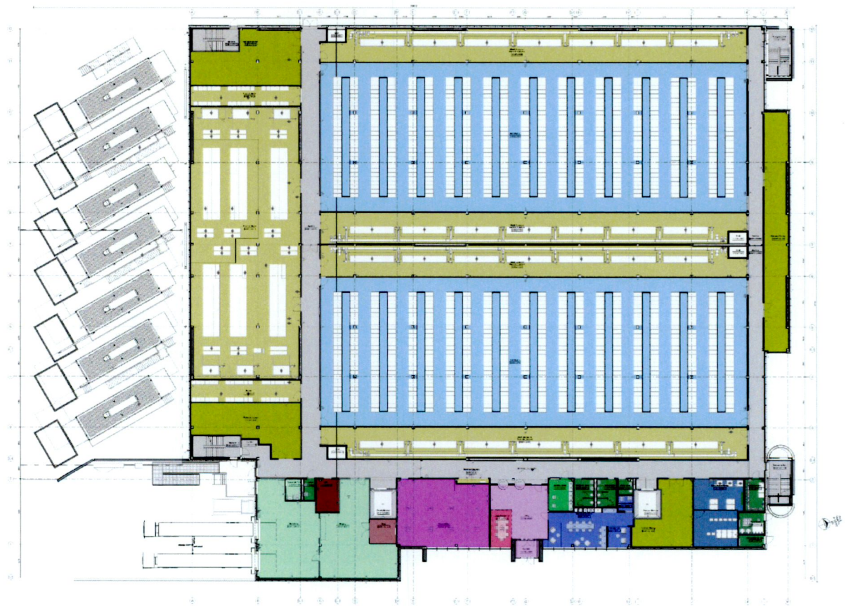
Figure 2: The proposed Ground floor plan

Most of the building area will be comprised of data processing equipment rooms, and the air-conditioning equipment which support the operation of those rooms. The uniform size of the data halls is a function of the tenant requirement for standardized space and to enable modular power and cooling plant to be used. There is also going to be a small administration component (offices and maintenance) for support personnel who operate and maintain the facility. The offices, staff facilities and storage rooms are in the east of the proposed development.