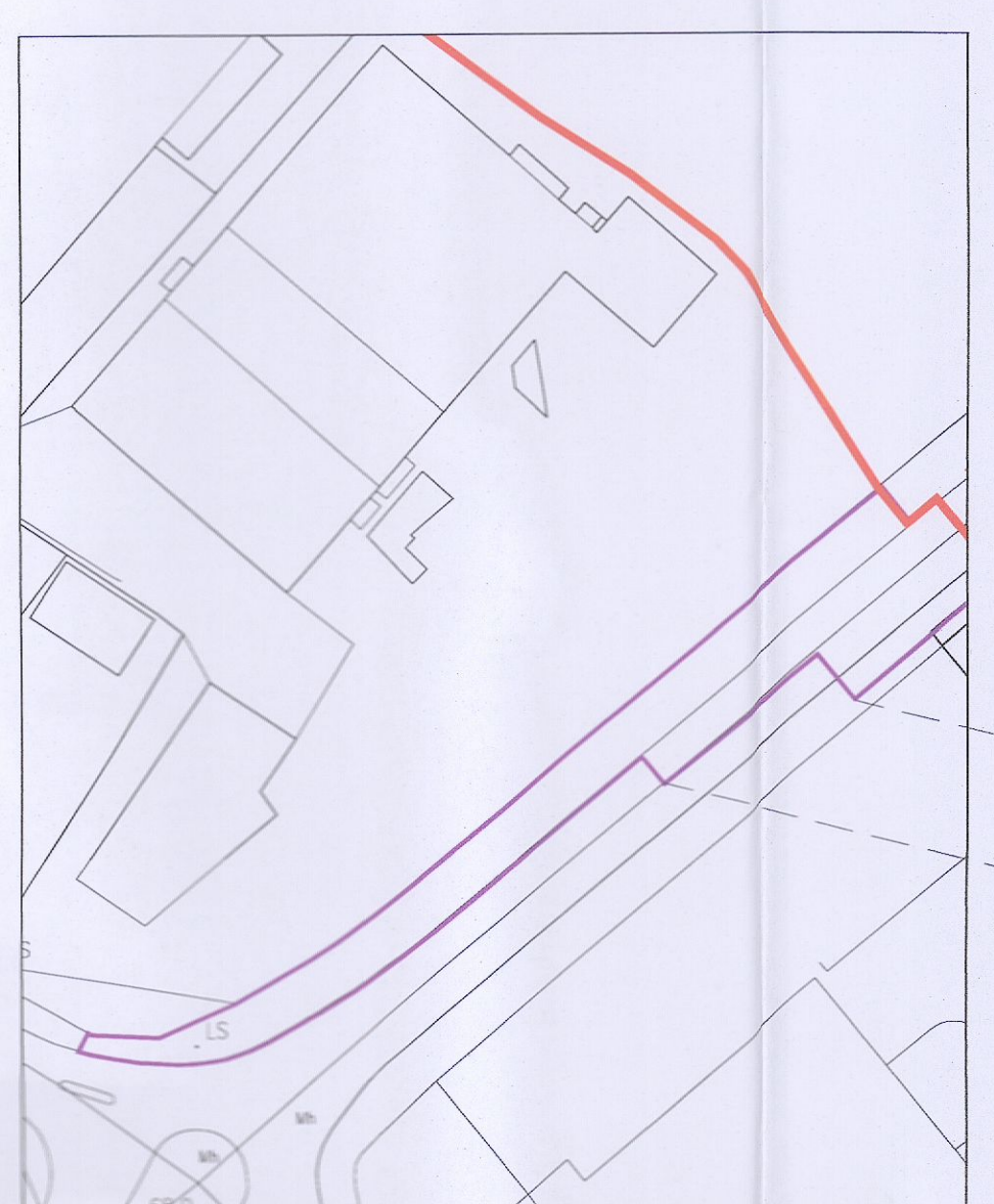
1 SITE LOCATION MAP CFI-170 Scale: 1:1000

COPYRIGHT: The design and details shown on this drawing are applicable to their project only and may not be reproduced in whole or in part or be used for any other project or purpose without the written permission of TOT Architects with whom copyright resides. DO NOT SCALE from this drawing. Use figured dimensions. Contractor to check all dimensions on site prior to commencement of works. Any discrepancies are to be referred to the ARCHITECT.