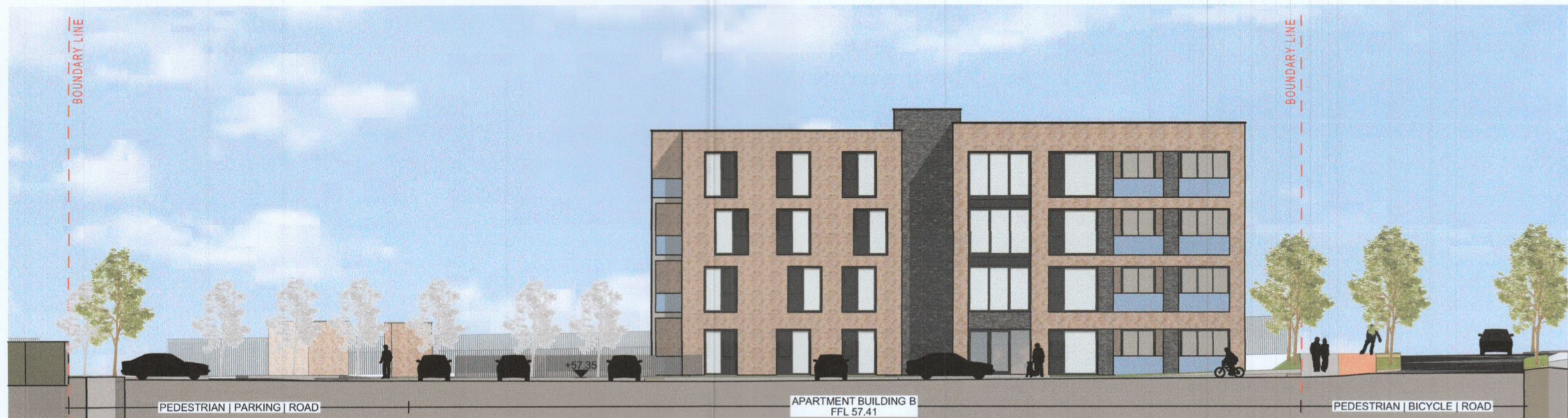
C Section SCALE 1:200