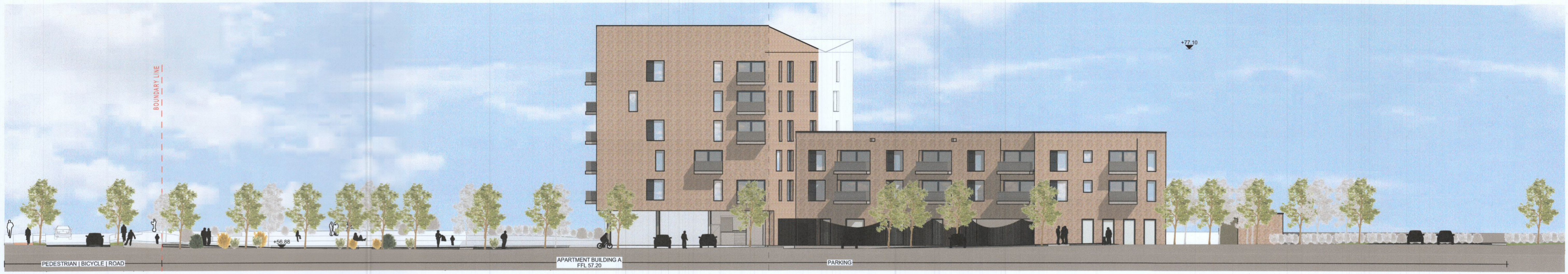
B Section SCALE 1:200