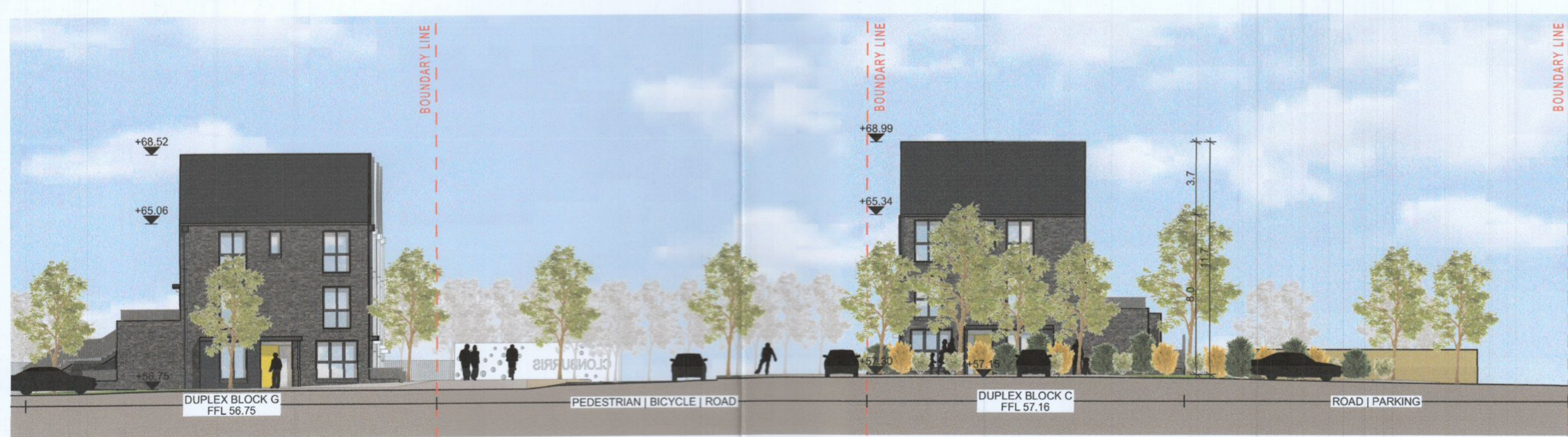
E Section SCALE 1:200