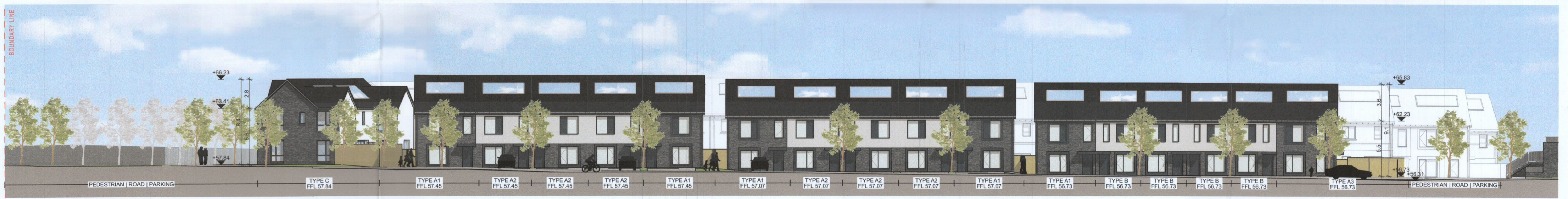
D Section SCALE 1:200