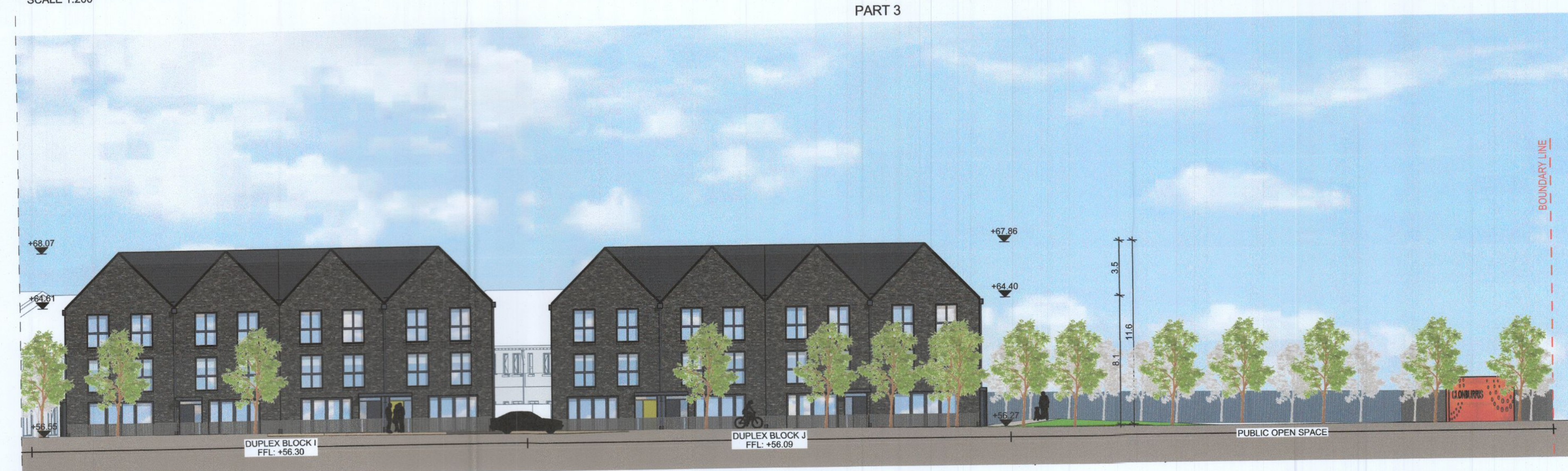
B Section SCALE 1:200