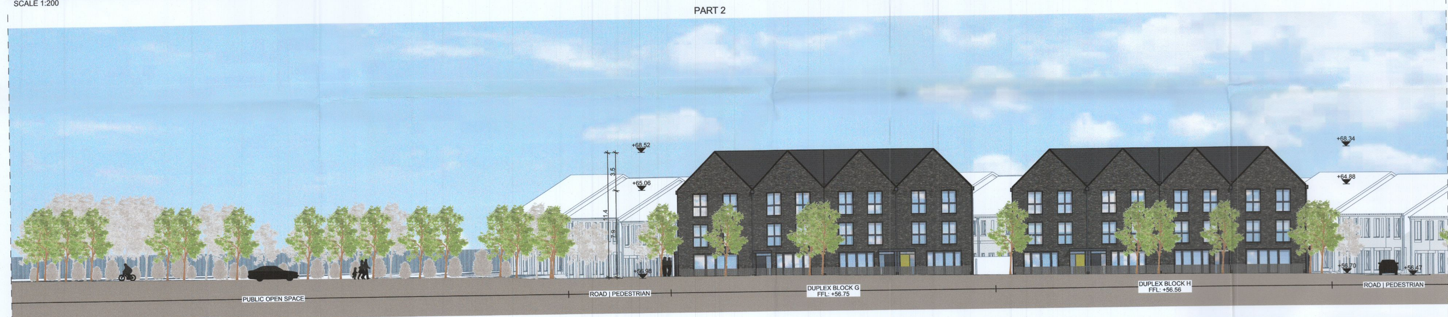
A Section SCALE 1:200