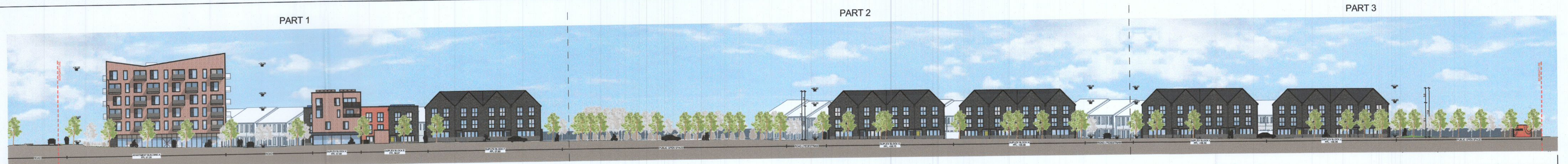
A Section SCALE 1:500