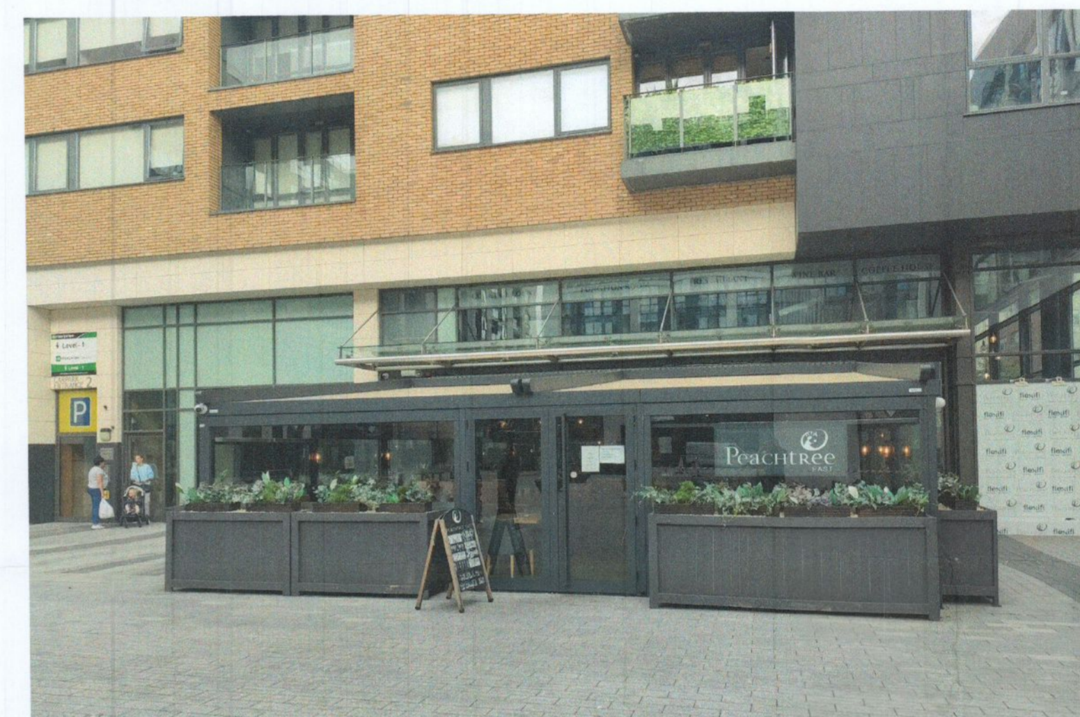
Image of Front Elevation