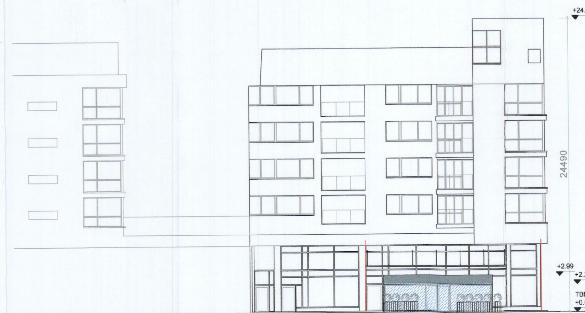
Proposed Contiguous Front Elevation Scale 1:200