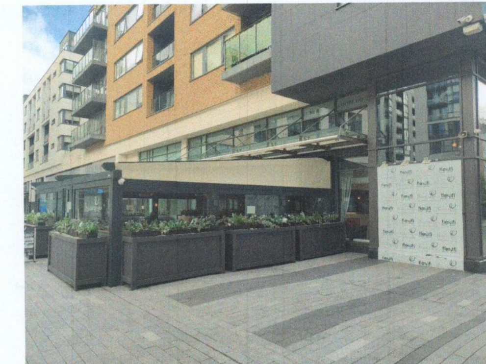
Image of Side Elevation