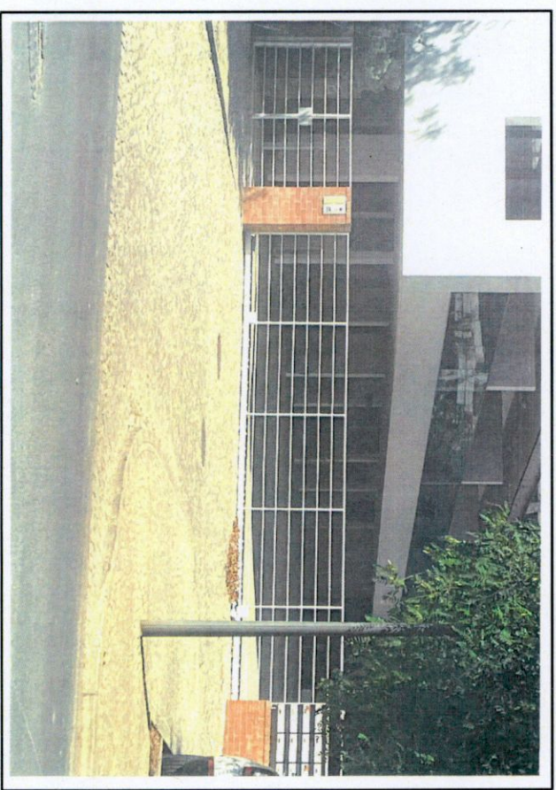
SIMILAR RAILING DETAIL