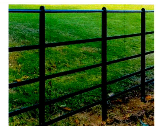
Type B & D- Metal "Estate Railings"