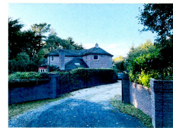
Type A- Existing walls, fence & gates (Photo 01)