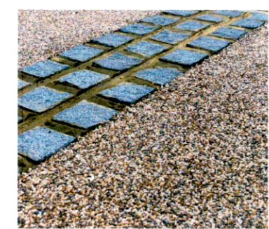
Type E- 300mm wide line of stone paving set in gravel driveway to denote boundaries Driveway to consist of Ballylusk fines/ gravel on permeable stabilising mat