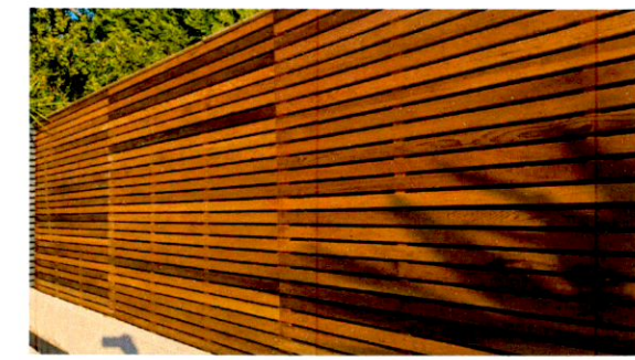
Type C- Timber Slat fence