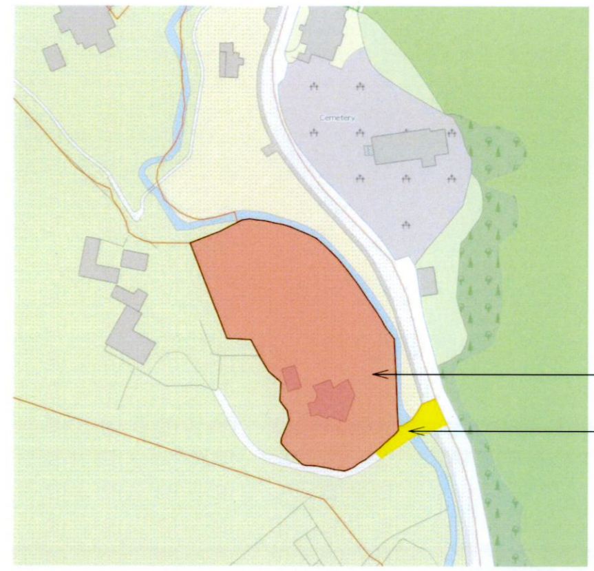
Folio & Access (not to scale)

Subject Site (Folio DN87846F) Right of Way