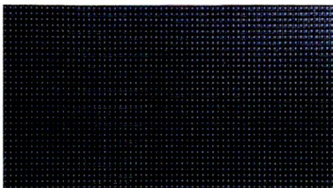
Image 2. Module Back