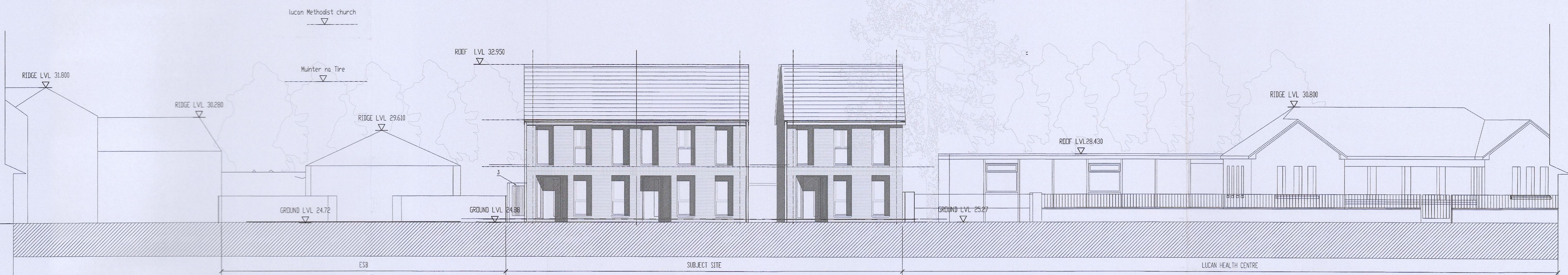
CONTIGUOUS ELEVATION SCALE 1:100