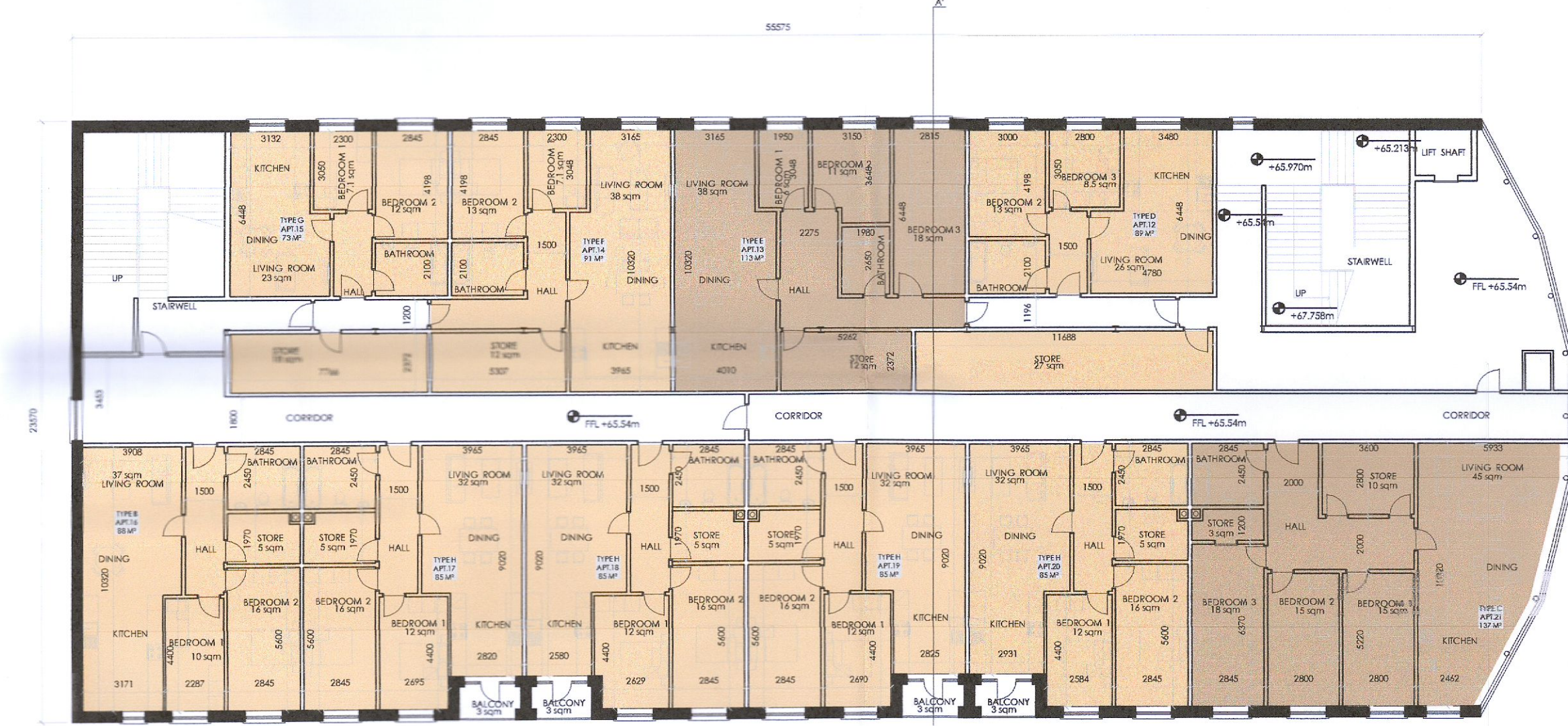
AS BUILT FIRST FLOOR PLAN 1:200