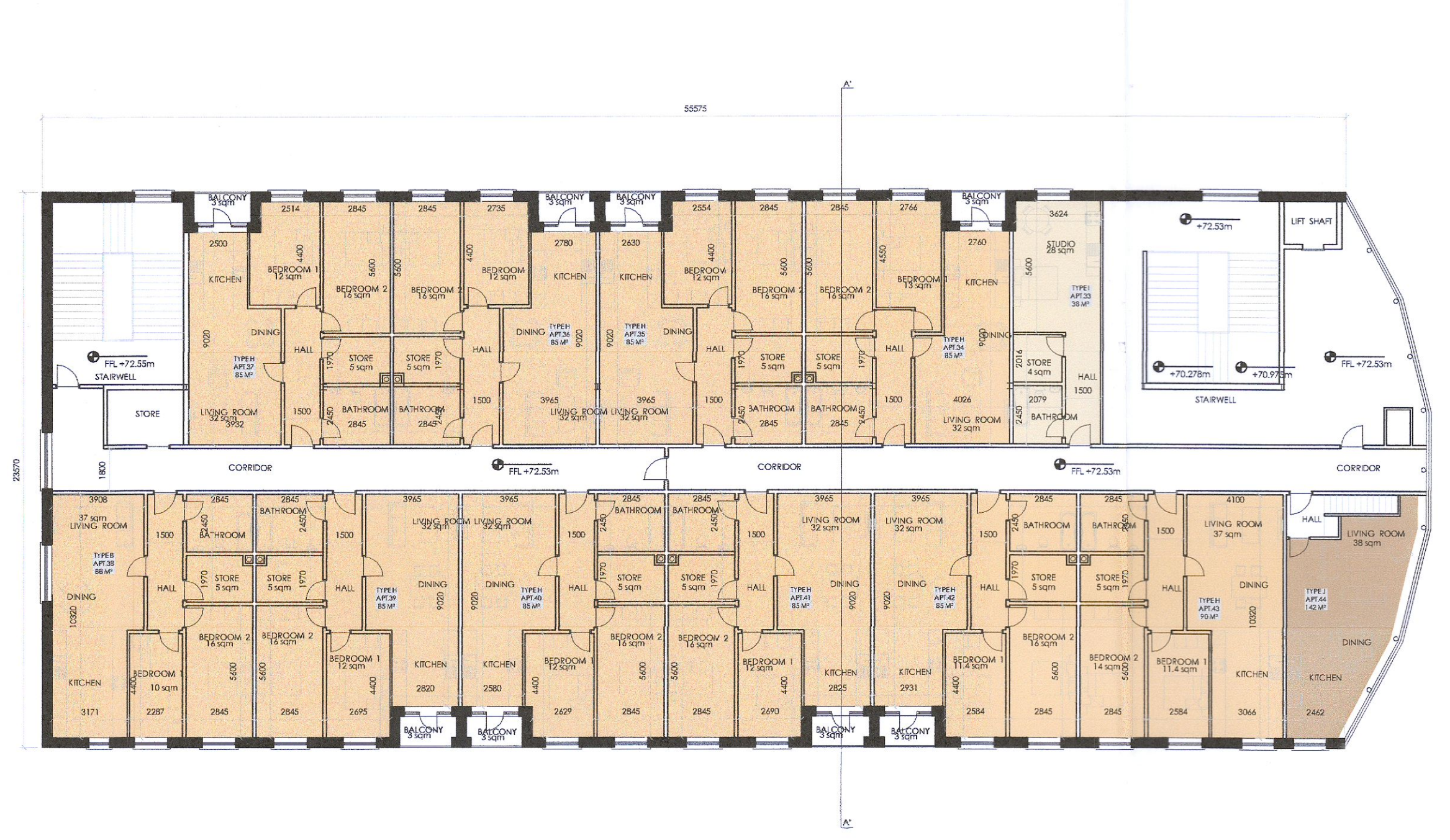
AS BUILT THIRD FLOOR PLAN 1:200