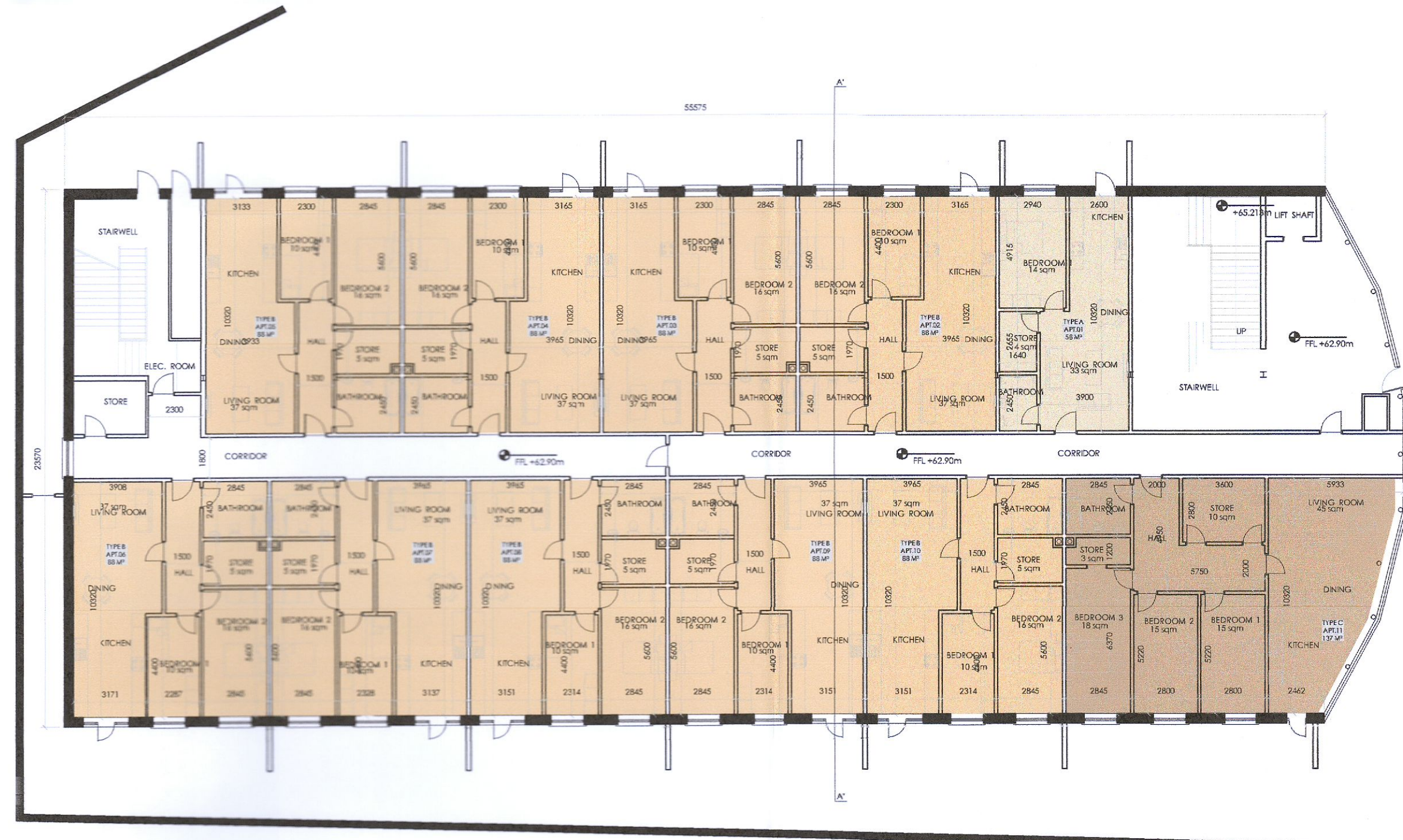
AS BUILT GROUND FLOOR PLAN 1:200

GENERAL NOTES: ** Do not scale from this drawing ** Use figured dimensions only © This drawing is copyright. No part of this document may be reproduced or transmitted in any form or stored in any retrieval system from the copyright holder, except as agreed for use on a project for which the document was originally issued.