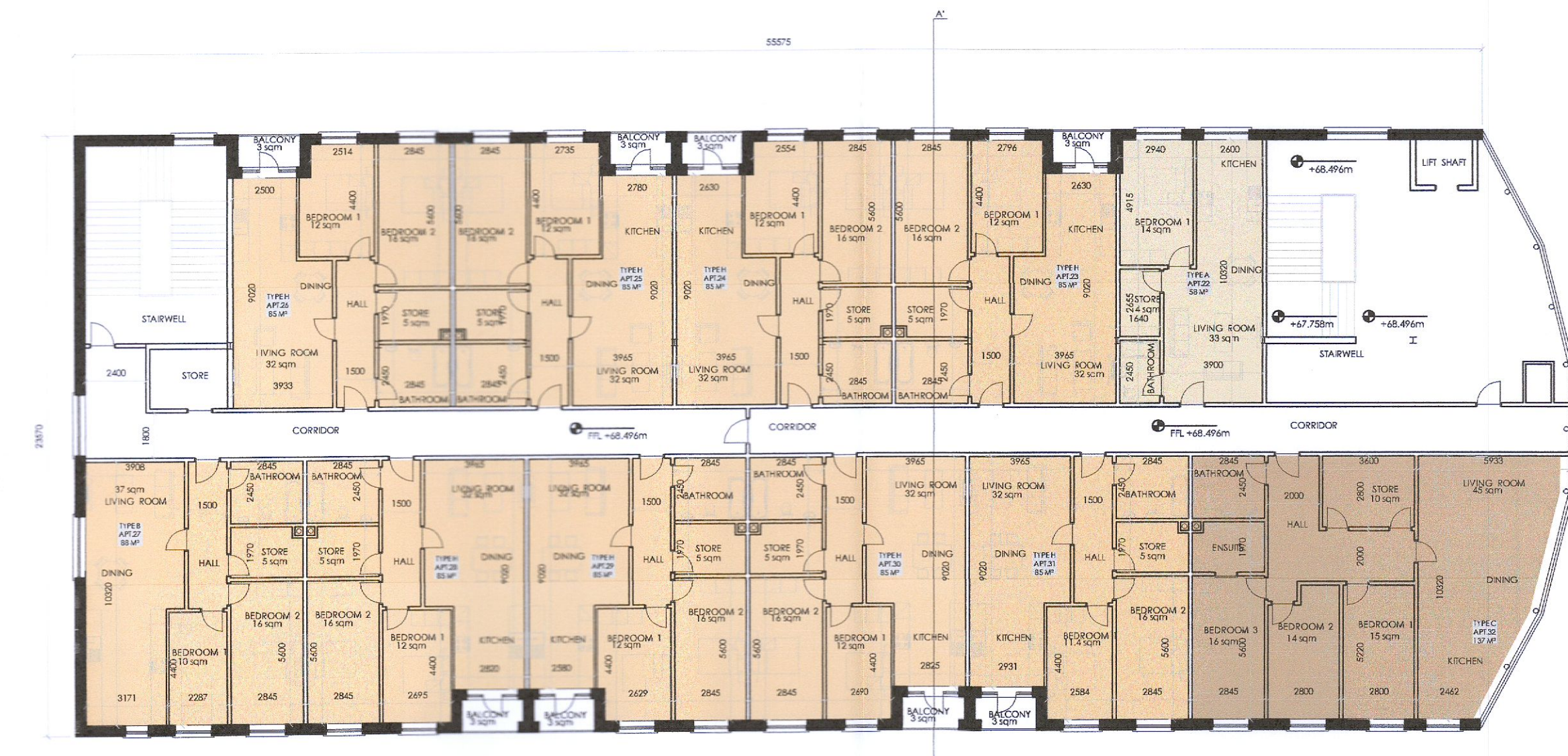
AS BUILT SECOND FLOOR PLAN 1:200