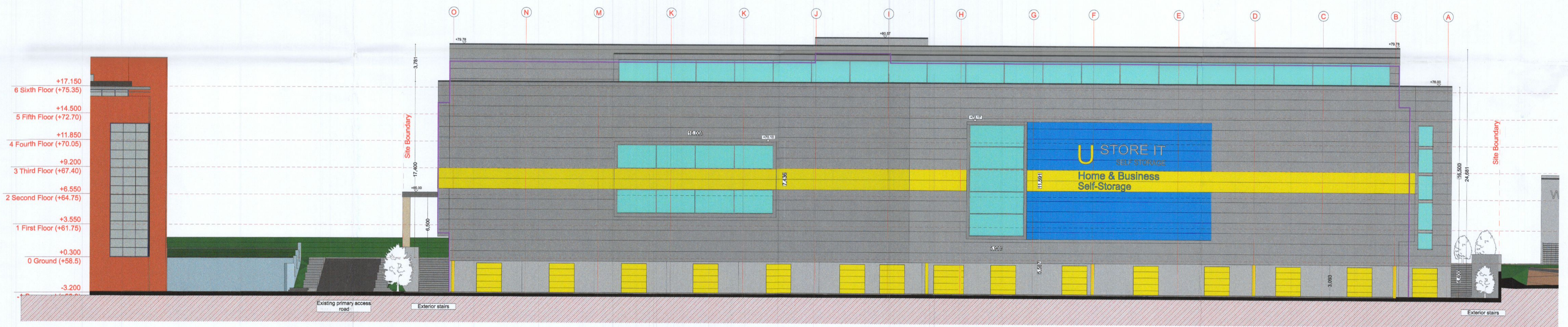
Proposed Elevation (North) - 1:200