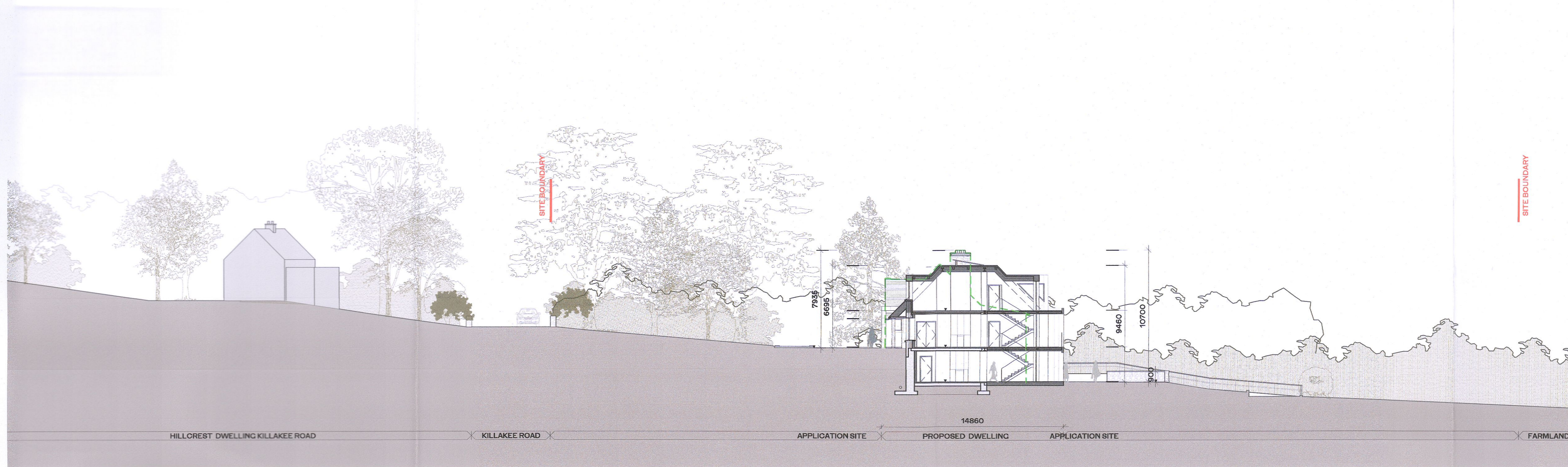
CONTEXTUAL SECTION A-A - PROPOSED - 1:200

NOTE ALL DIMENSIONS TO BE CHECKED ON SITE NO DIMENSIONS TO BE SCALED FROM THIS DRAWING THIS DRAWING IS TO BE READ IN CONJUNCTION WITH RELEVANT CONSULTANTS DRAWINGS