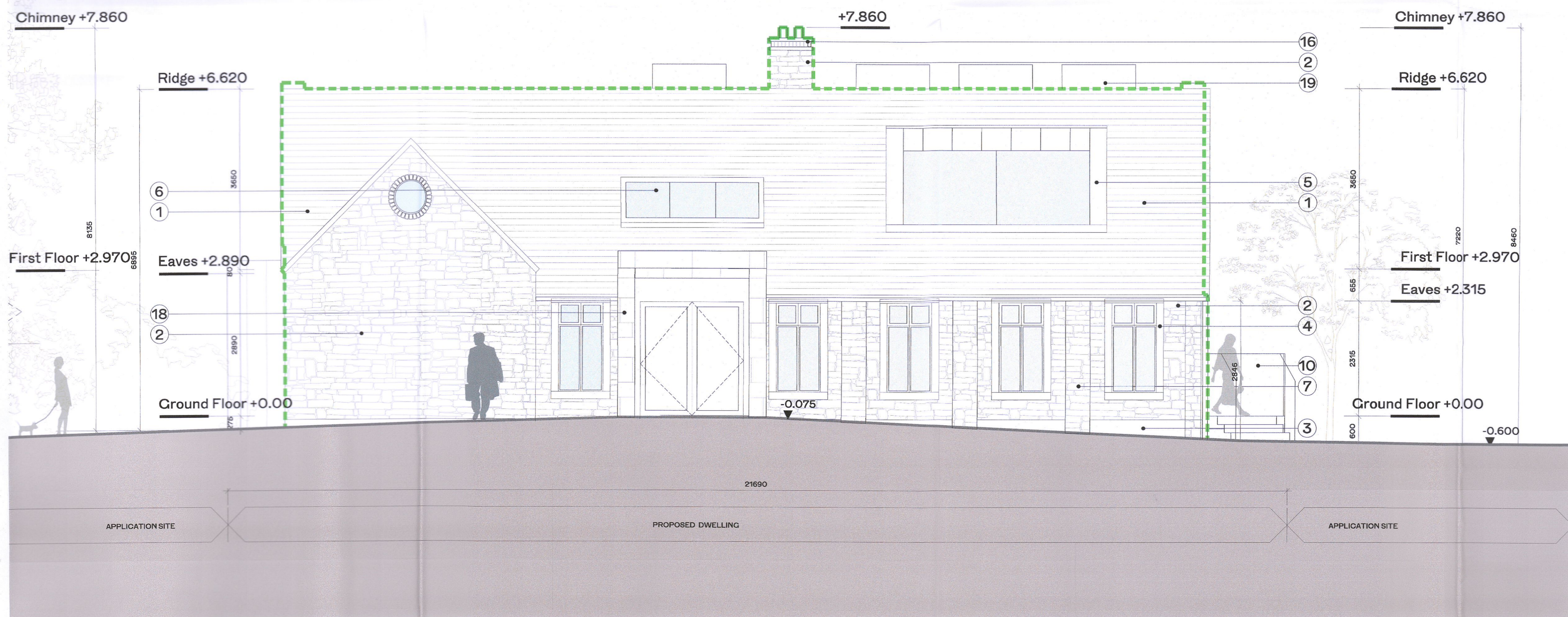
WEST ELEVATION - PROPOSED - 1:50