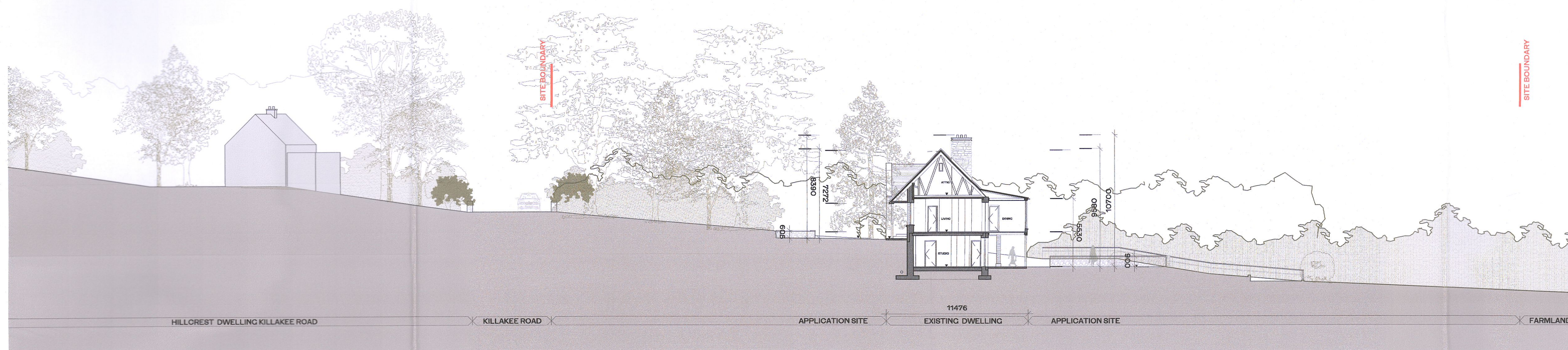
CONTEXTUAL SECTION A-A - EXISTING - 1:200