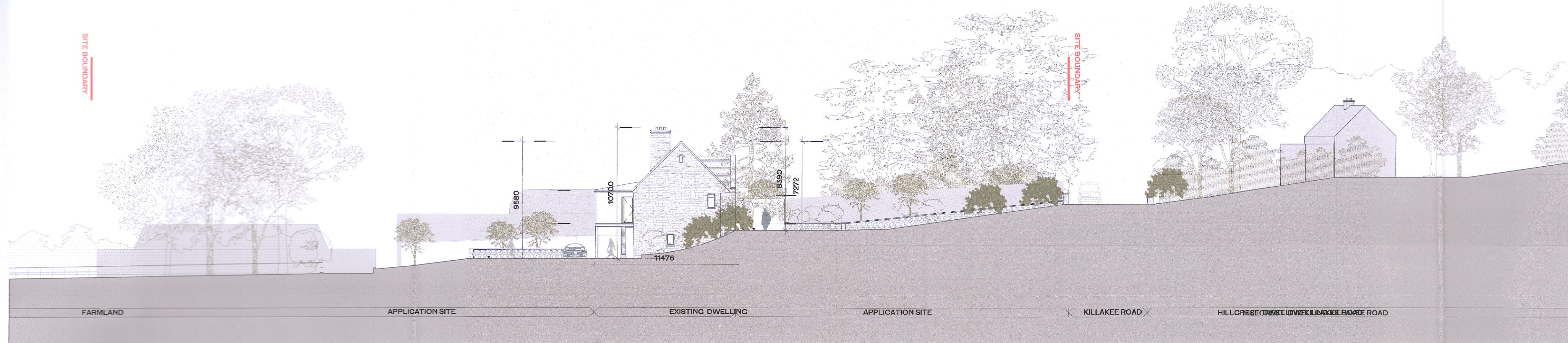
NORTH CONTEXTUAL ELEVATION - EXISTING - 1:200