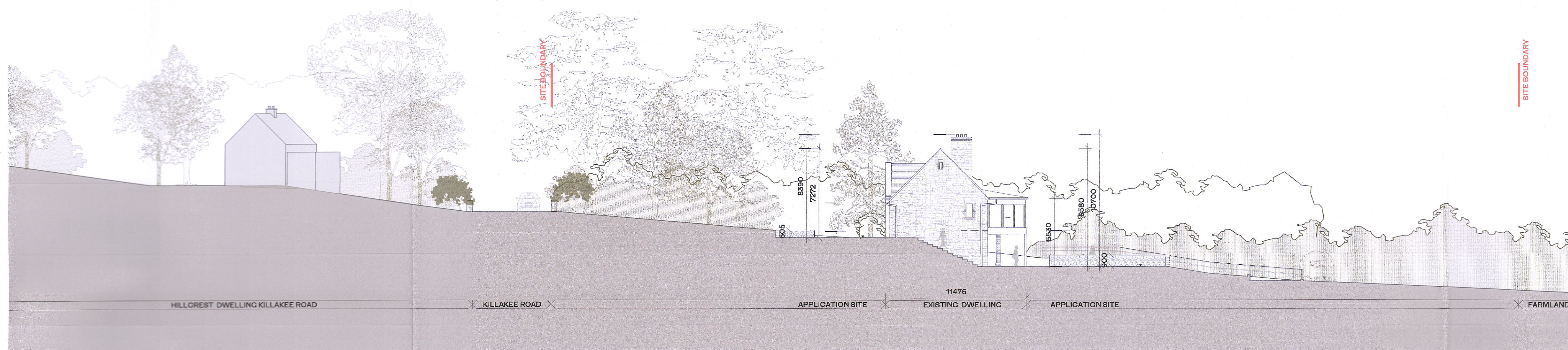
SOUTH CONTEXTUAL ELEVATION - EXISTING - 1:200