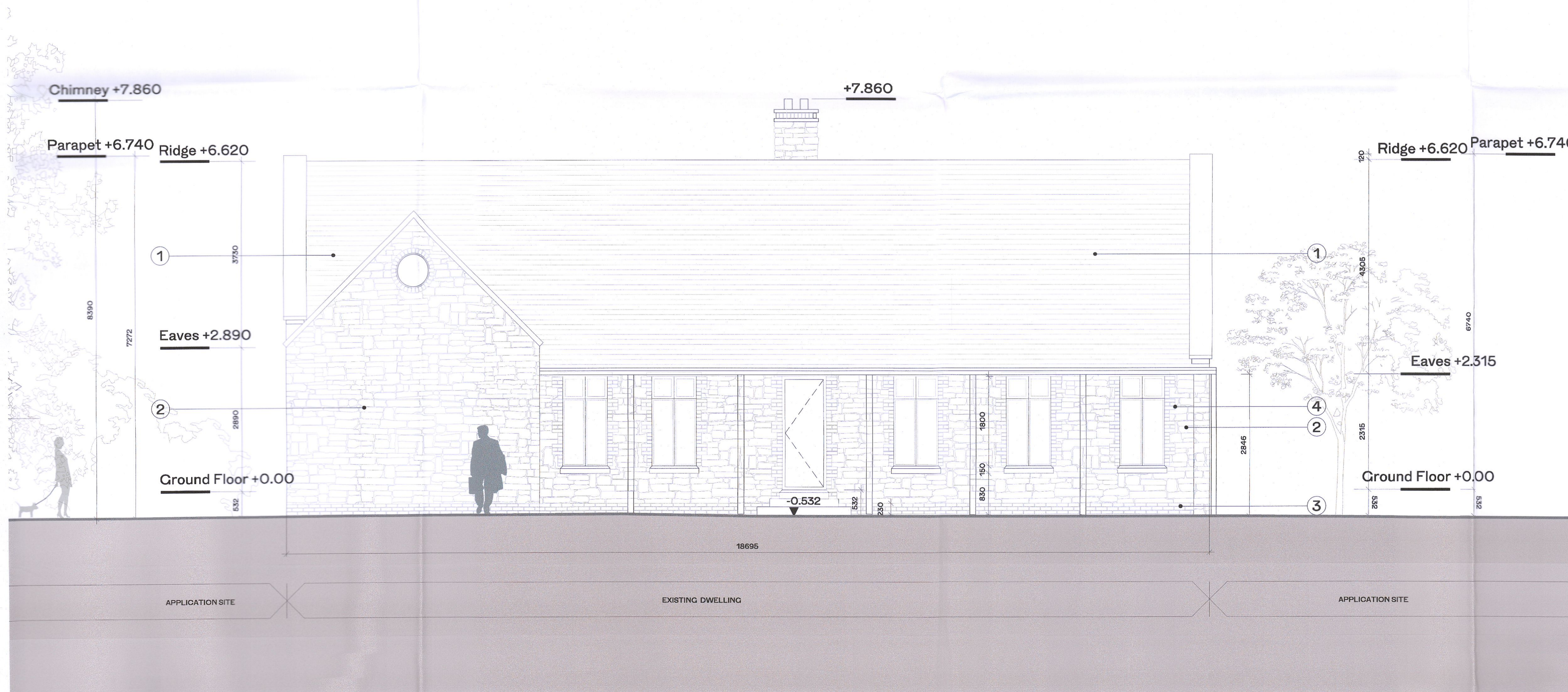
WEST ELEVATION - EXISTING - 1:50