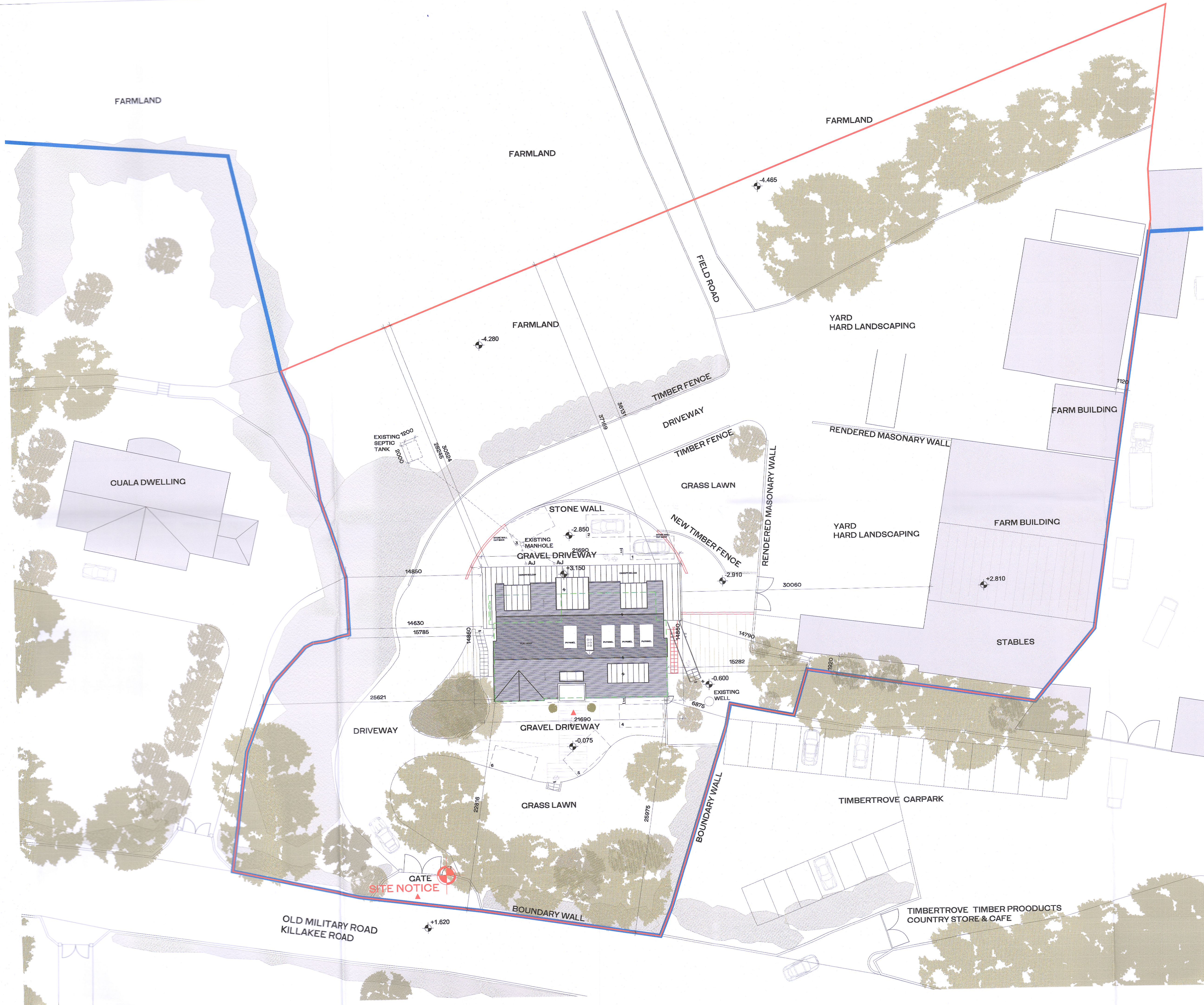
SITE LAYOUT PLAN - PROPOSED