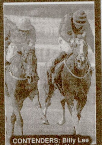
CONTENDERS: Billy Lee (left) and Colin Keane

2021: Turf Range 5 9 6, Wayne Lordan 16/1 (D Broad), 14 ran. Star Betting 7-2 Dragon Roll, 6 Alfalfa, 7 Baby Bubbles, Boom Boom Boom, 8 Contrapposto, Latari, 10 Dr Patrick, Satono Chevalier, 16 Numbidia, Tenth Amendment, 20 Others STARFORM SATONO CHEVALIER Danger CHATEAU MUSAR