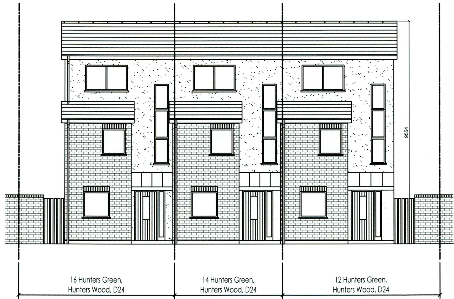
PROPOSED FRONT ELEVATION & CONTIGUOUS ELEVATION

NEW TIMBER FRAME WALL ZINC: 4mm zinc panel 18mm W.B.P. plywood 38mm Treated Vertical intermittent Timber battens Breather membrane 9mm OSB 100 x 50mm stud to Engineers specification 100mm Xtratherm XO/FB insulation between studs 25mm Xtratherm XO/FB insulation on studs New Isover Vario KM Duplex Membrane airtightness and vapour control layer 15mm fireline plasterboard with 3mm skim coat painted