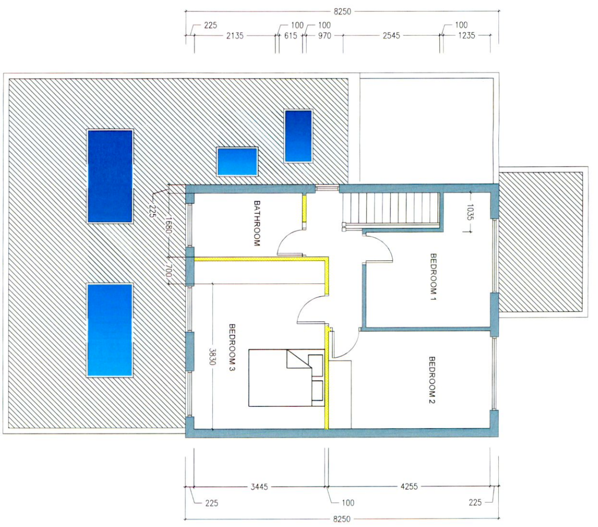
PROPOSED FIRST FLOOR PLAN & ROOF PLAN