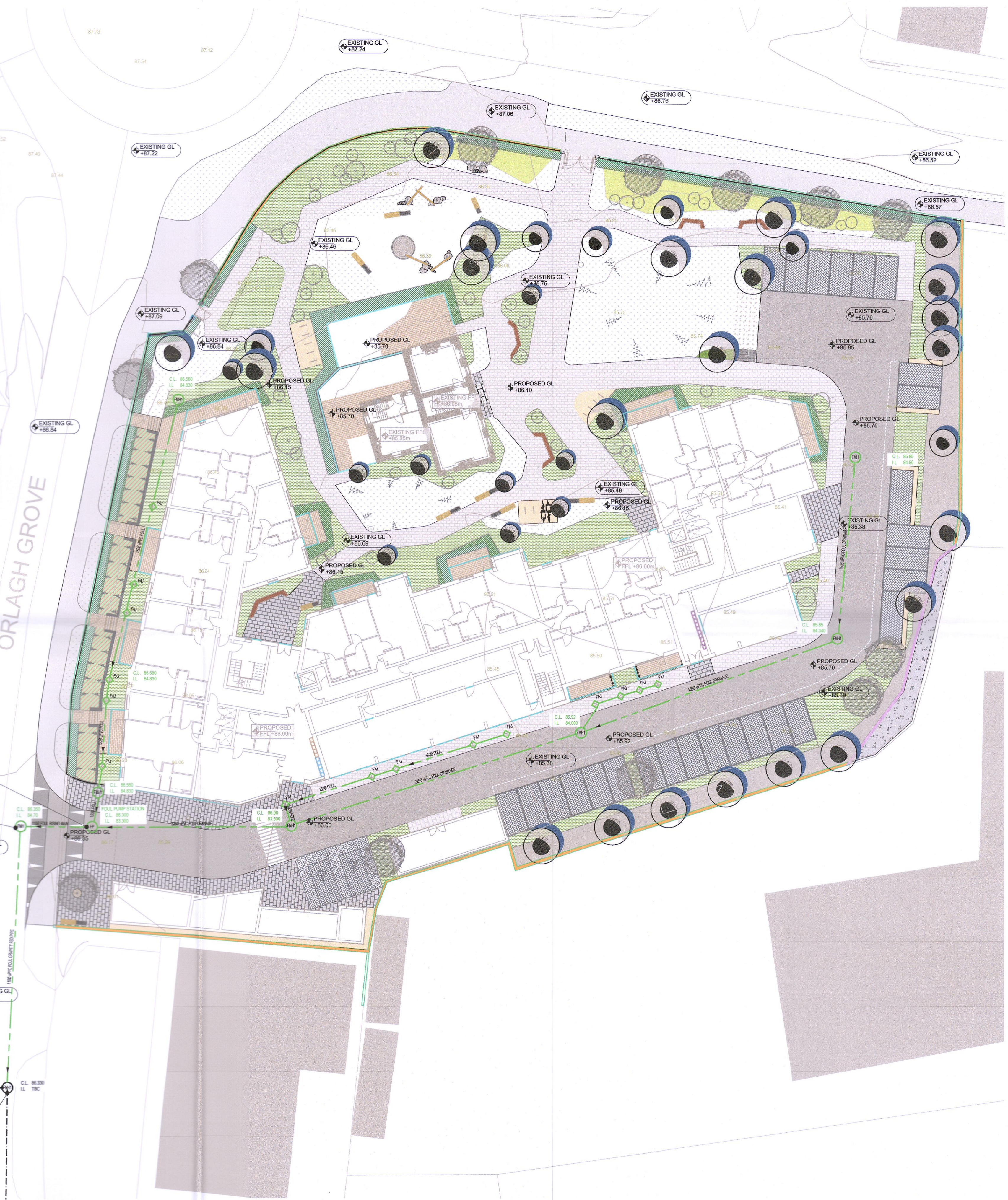
PROPOSED FOUL DRAINAGE LAYOUT PLAN SCALE 1:250