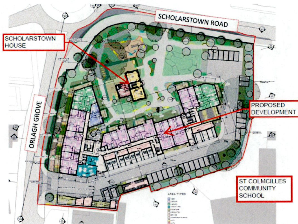
Figure 1 - Proposed Site Plan

The site is currently a greenfield site which accommodates Scholarstown House and a number of outbuildings. – See figure 1 below (Proposed Site Plan)