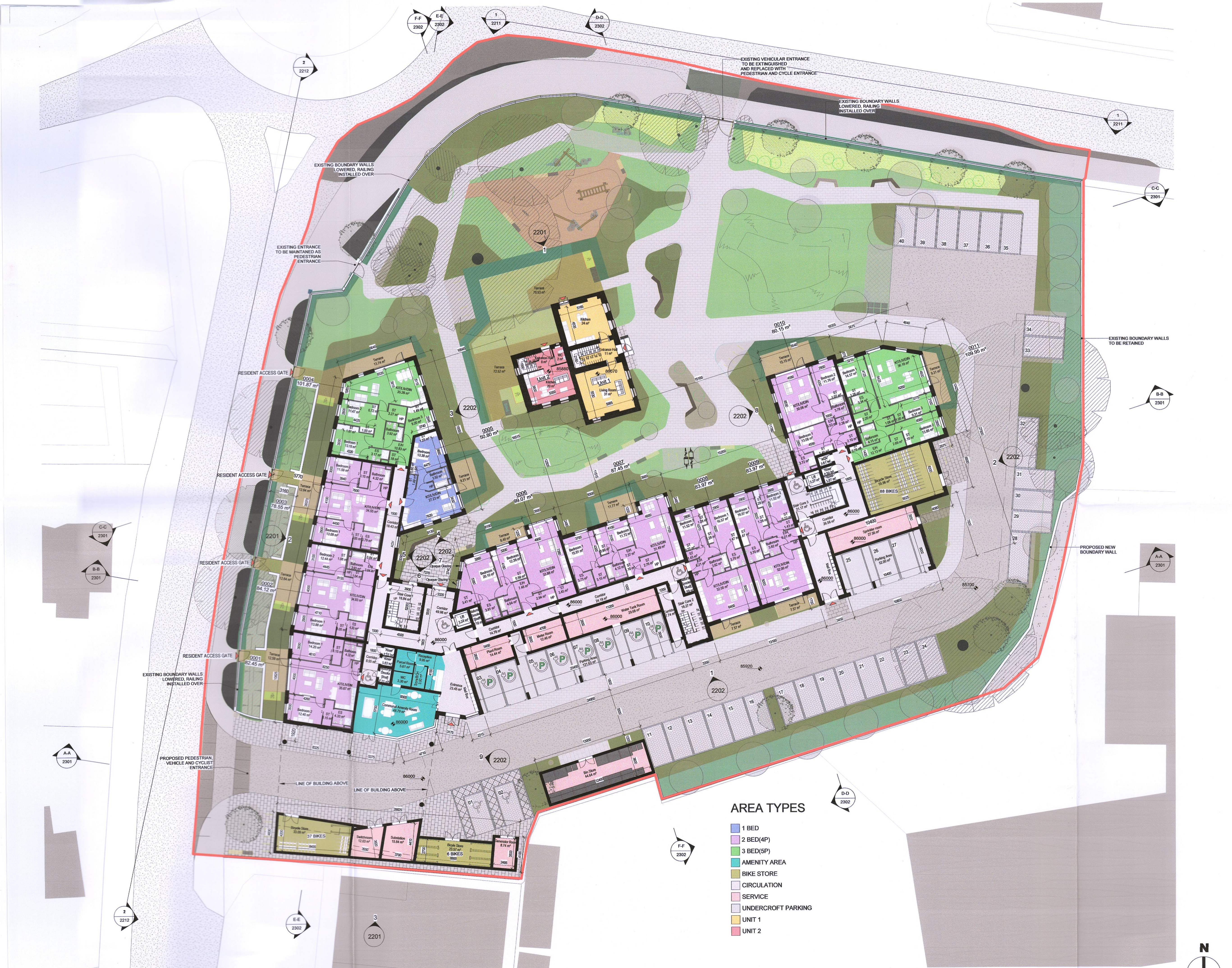
1 L00-PROPOSED GROUND FLOOR PLAN 1:200

Please consider the environment before printing this sheet