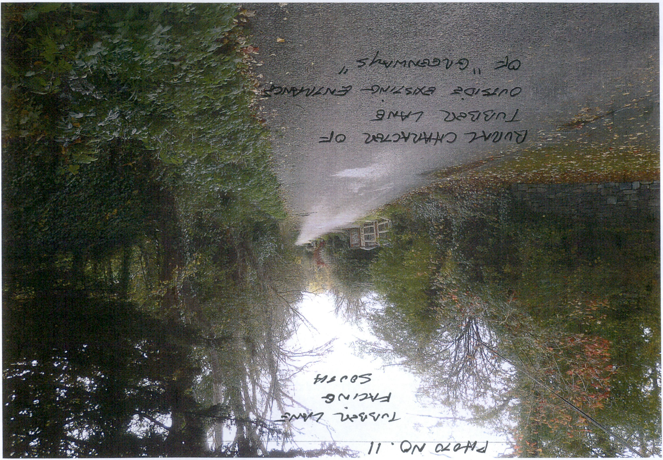
PHOTO NO. 11 TUBBER LANE FACING SOUTH