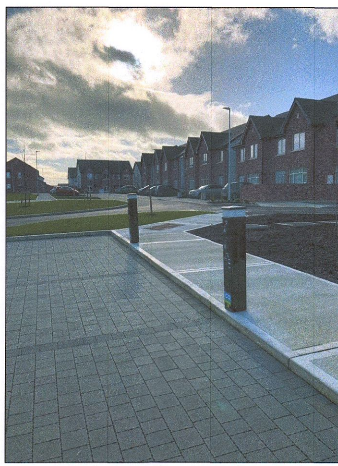
EXAMPLE: TYPICAL EV PEDESTAL POSTS

EV PEDESTAL POST 2 No. CHARGING POINTS PER POST