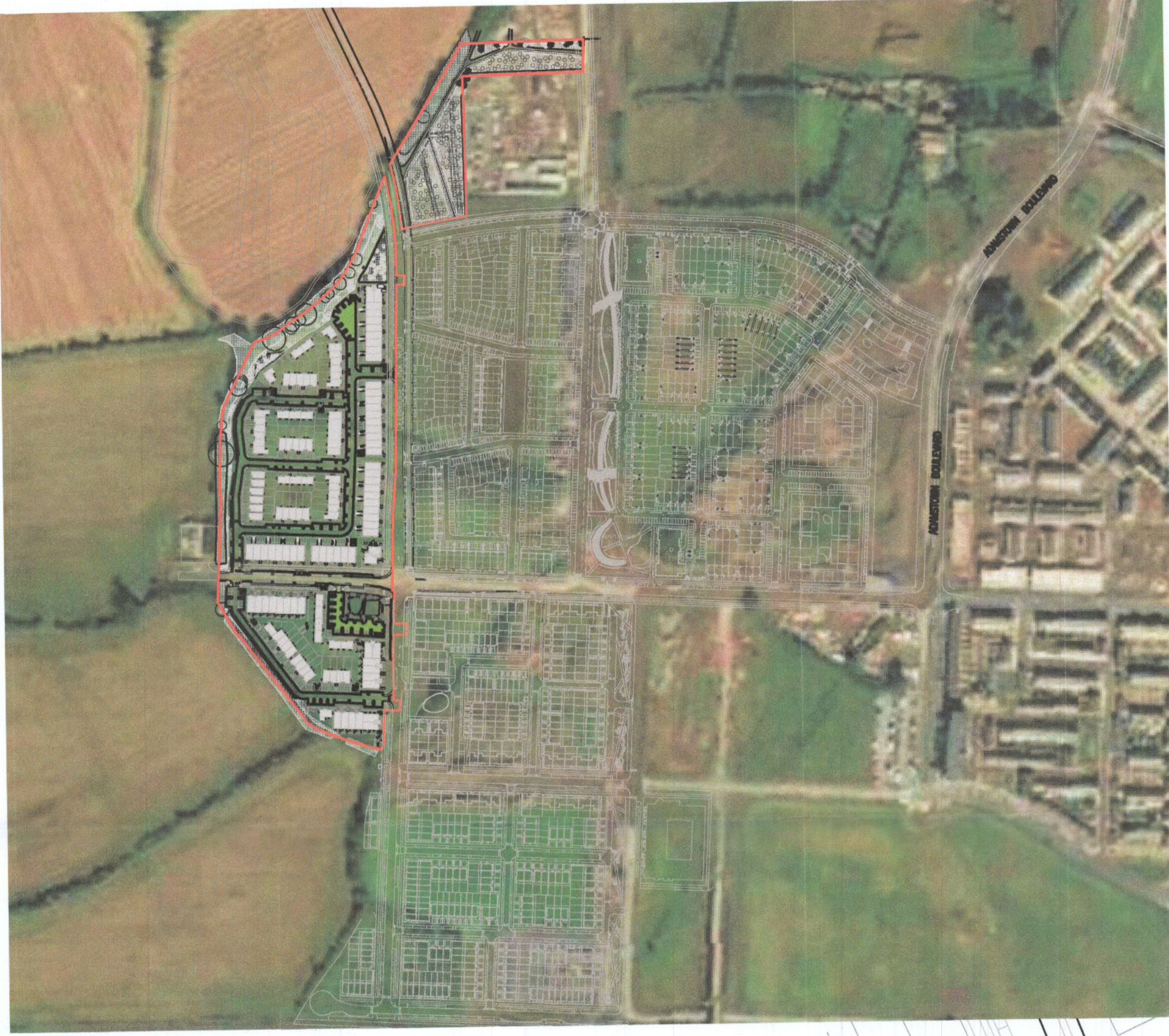
SITE LOCATION MAP SCALE 1:2500