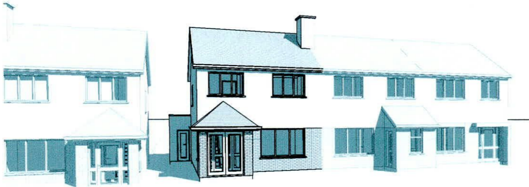
5 3D Perspective Front Existing