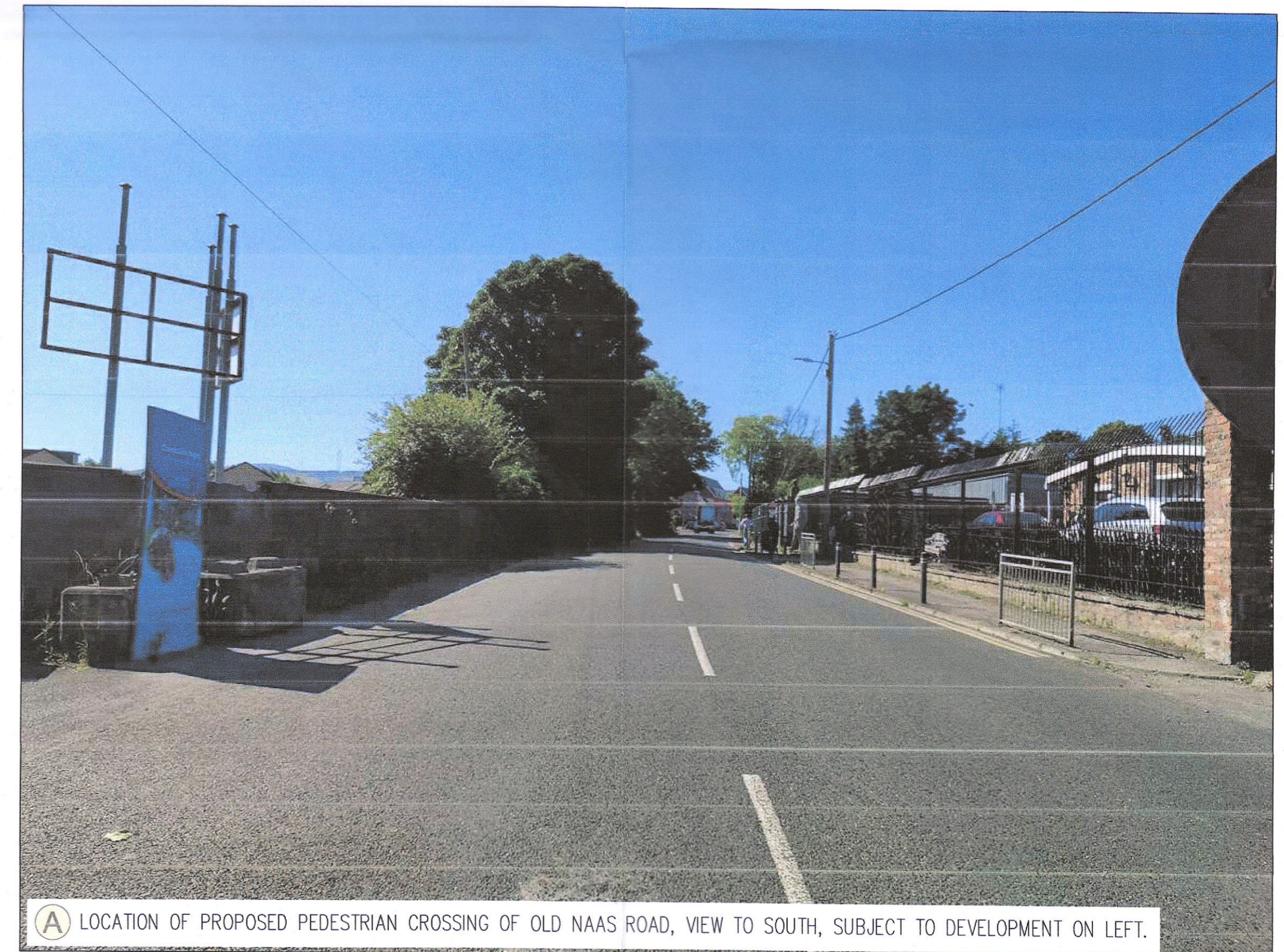
(A) LOCATION OF PROPOSED PEDESTRIAN CROSSING OF OLD NAAS ROAD, VIEW TO SOUTH, SUBJECT TO DEVELOPMENT ON LEFT.