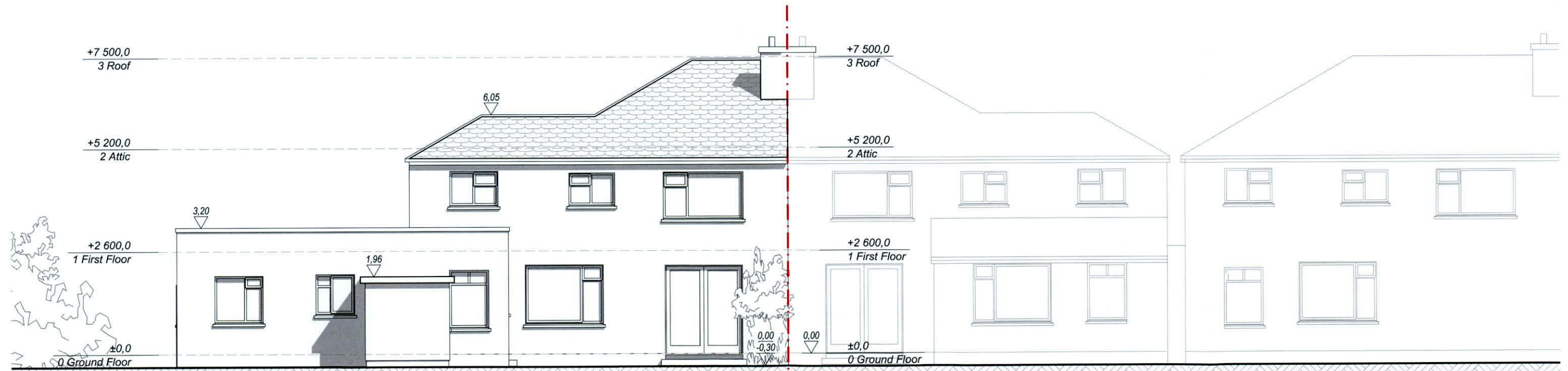
Existing Rear Elevation 1:100