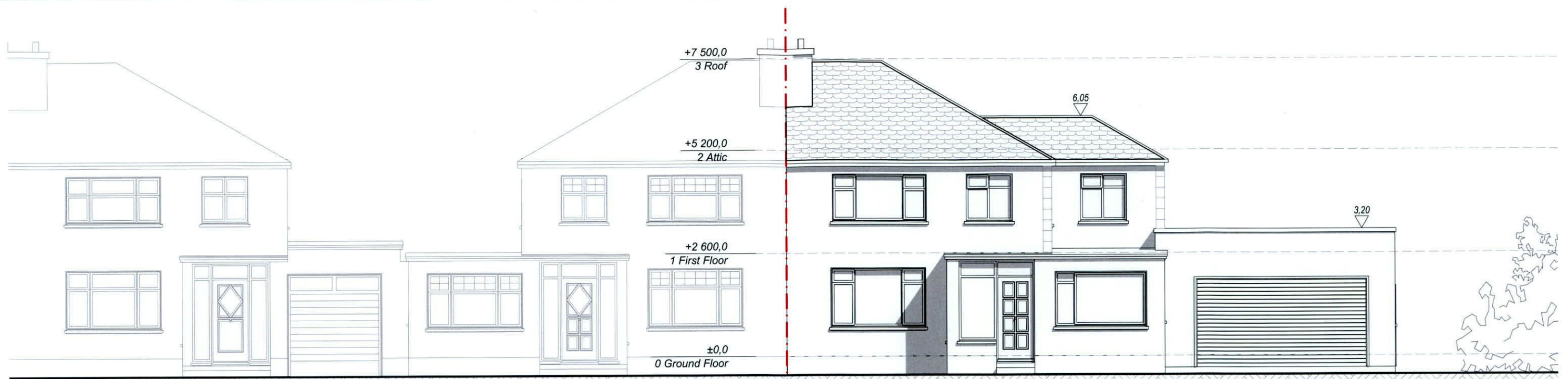
Neighbouring Property: 20 Bancroft Grove Existing Front Elevation 1:100