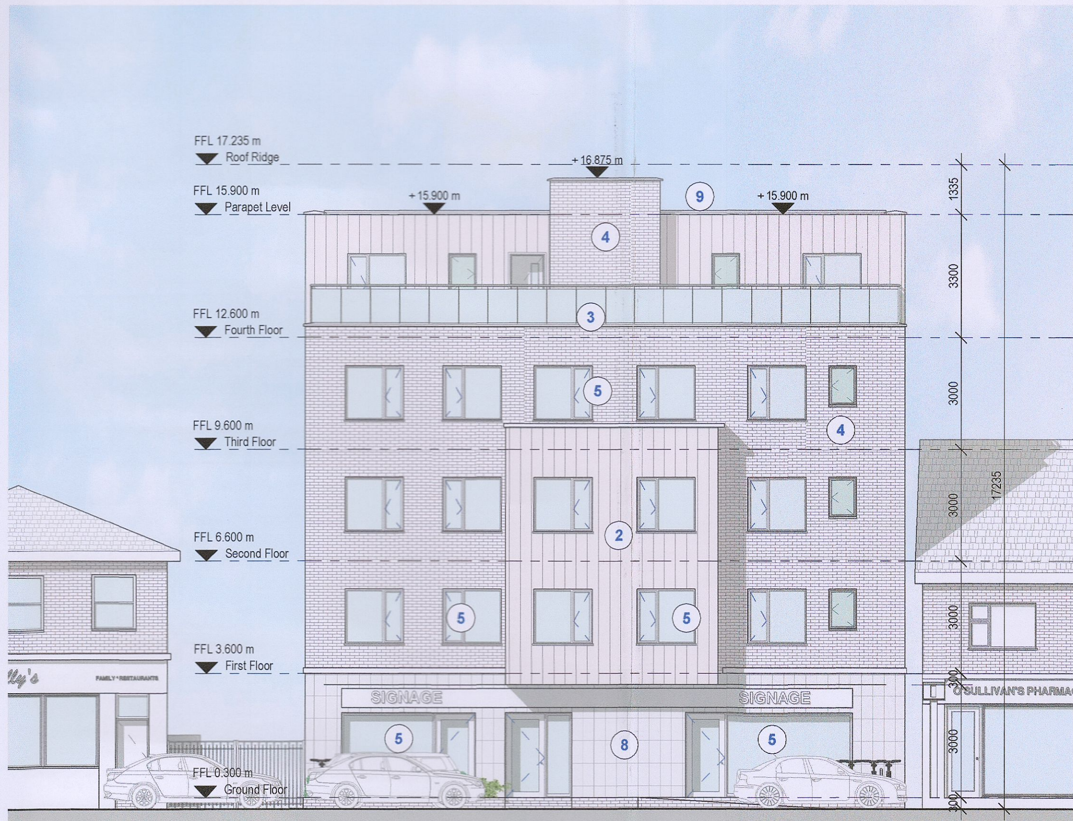
1 PROPOSED FRONT ELEVATION (NORTH FACING) SCALE 1 : 100