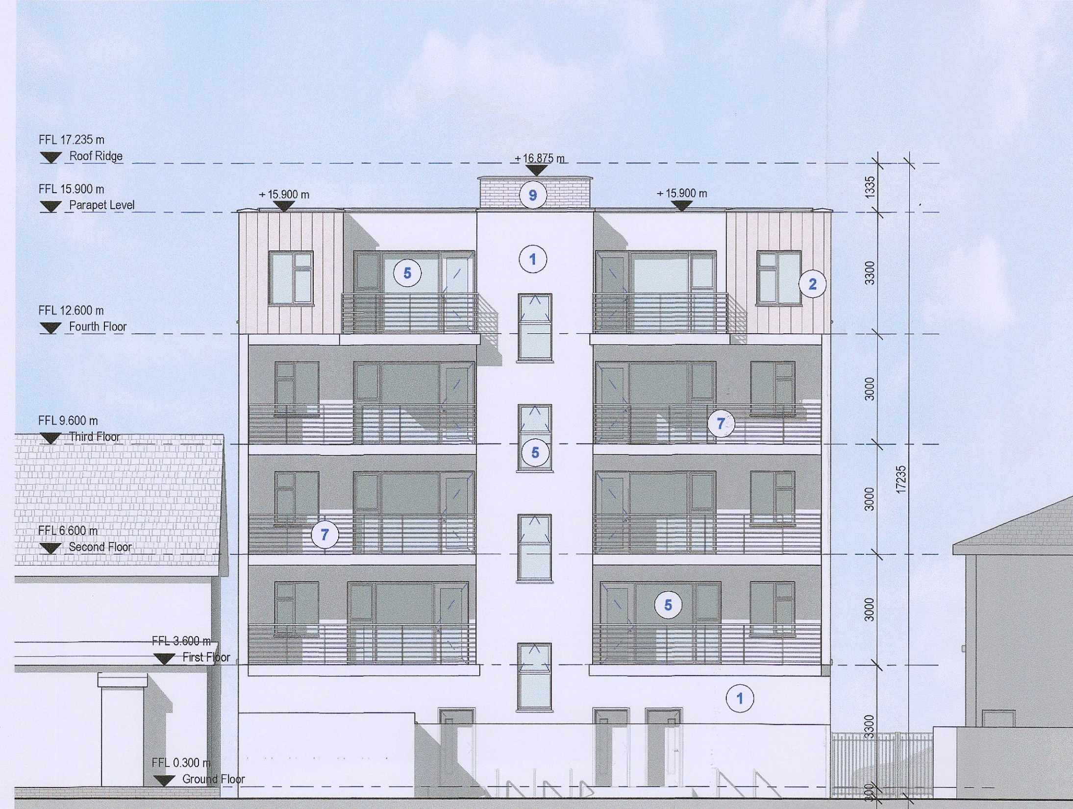
2 PROPOSED REAR ELEVATION (SOUTH FACING) SCALE 1 : 100