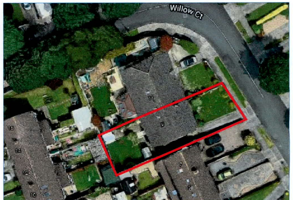
Aerial Map Site Photo 1:500 (+/-)