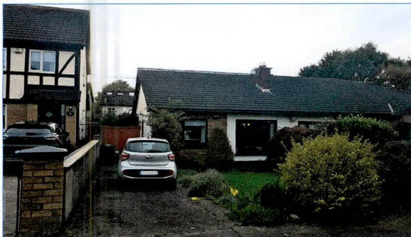
Existing Front (East) NTS