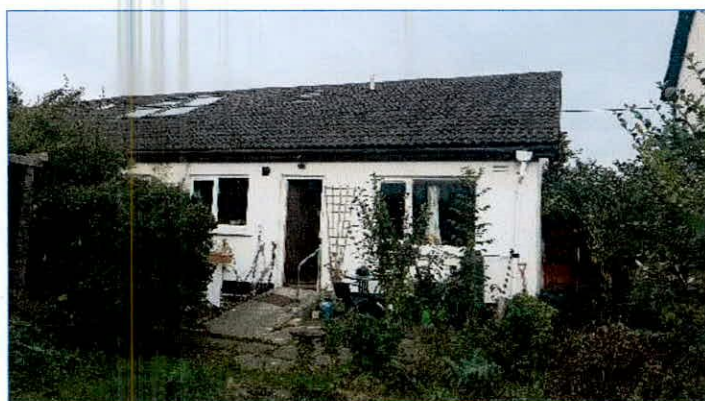
Existing Rear (West) NTS