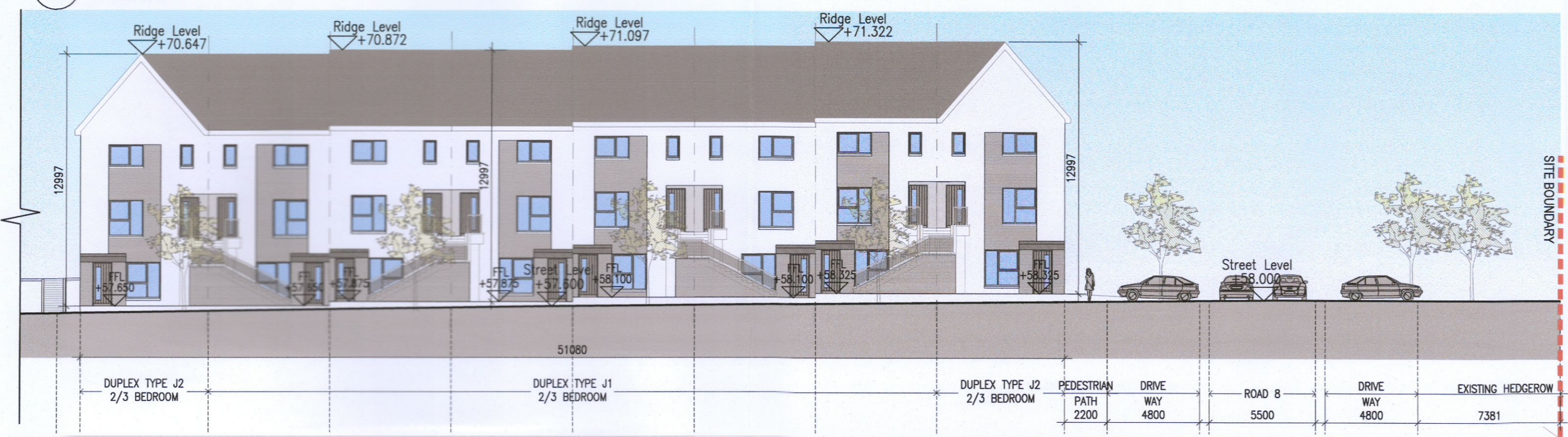
08-B P024 1:200 @ A1 Elevation 08 - ADAMSTOWN WAY - Part 2