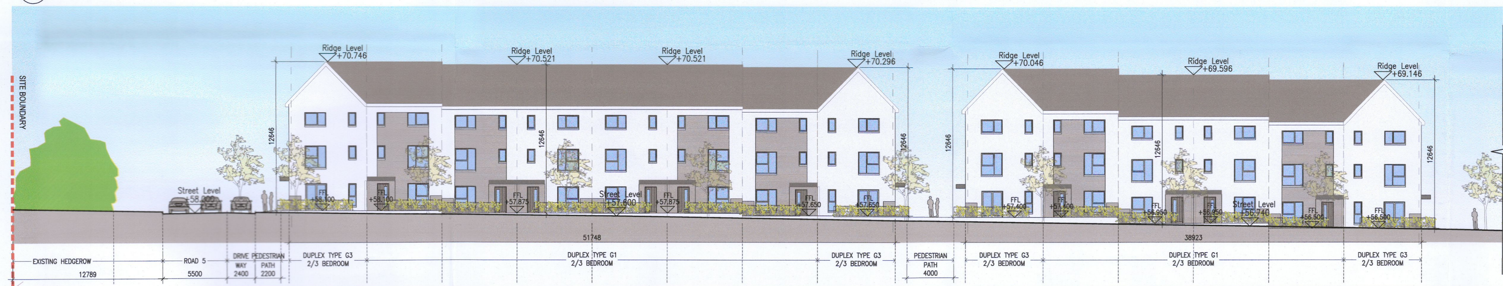
09-A P024 1:200 @ A1 Elevation 09 - ADAMSTOWN WAY - Part 1