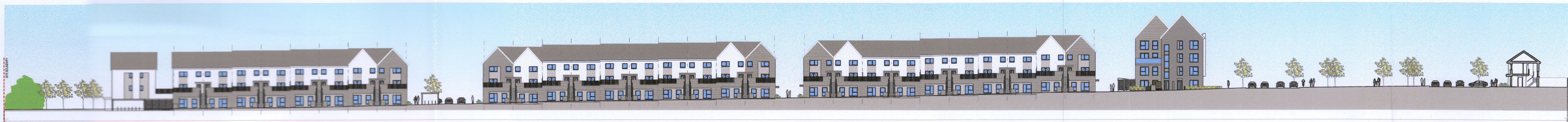
04 Elevation 04- Road 1 1:500 @ A1