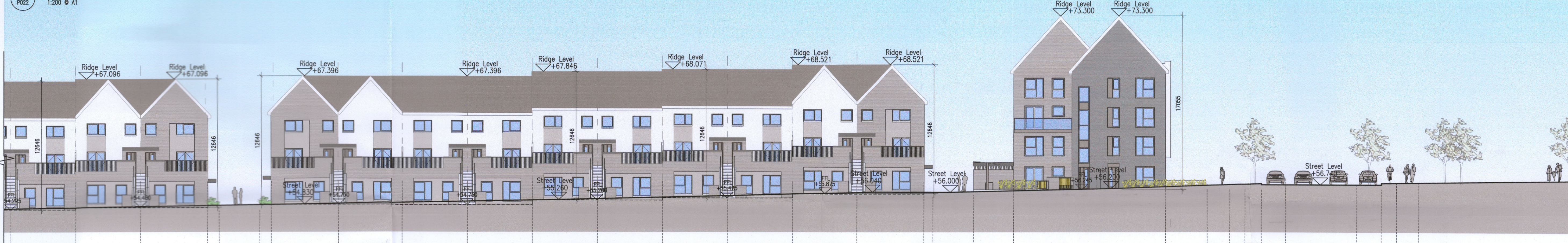
04-B Elevation 04 - Road 1 - Part 2 1:200 @ A1