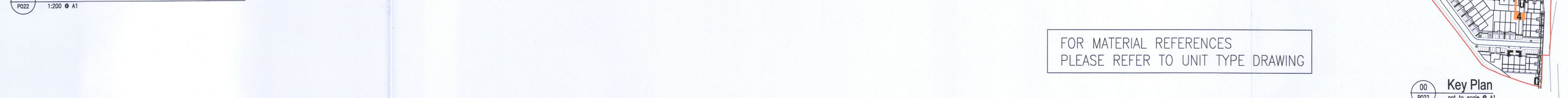
00 Key Plan not to scale @ A1

FOR MATERIAL REFERENCES PLEASE REFER TO UNIT TYPE DRAWING