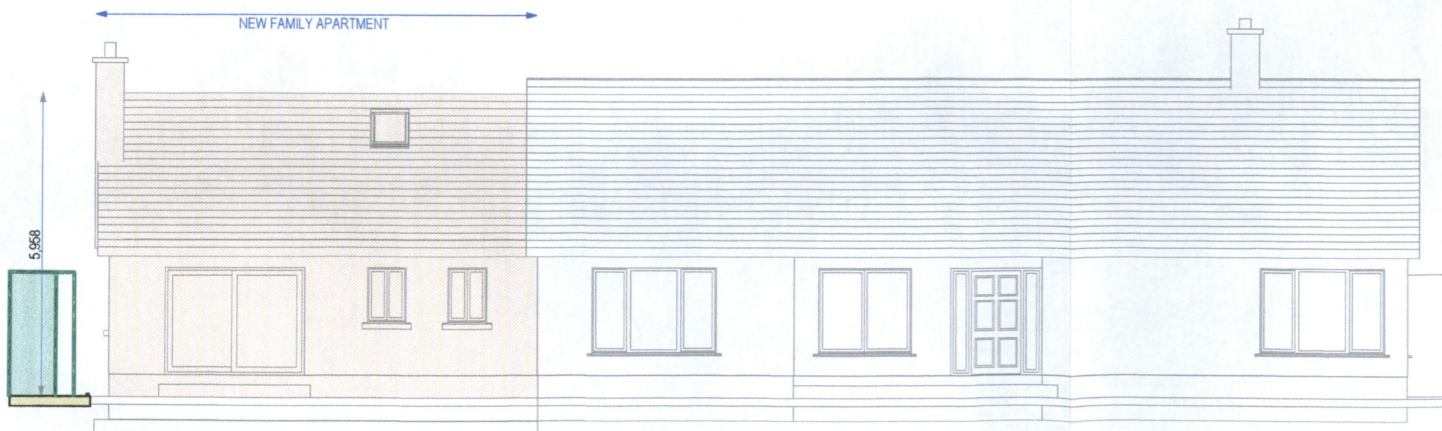
A/1 - FRONT ELEVATION - SOUTH EAST