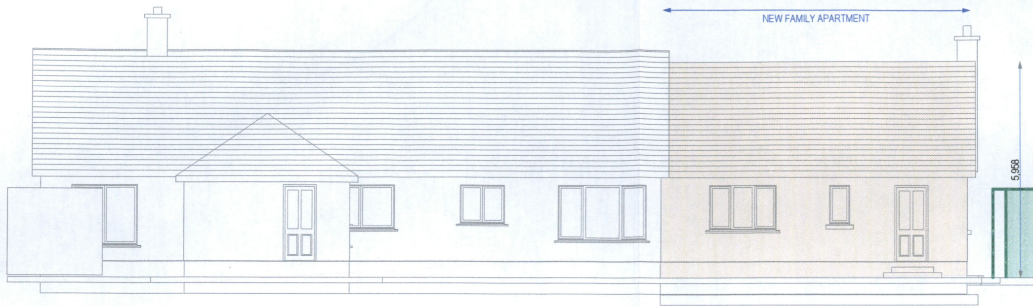
A/2 - REAR ELEVATION - NORTH EAST