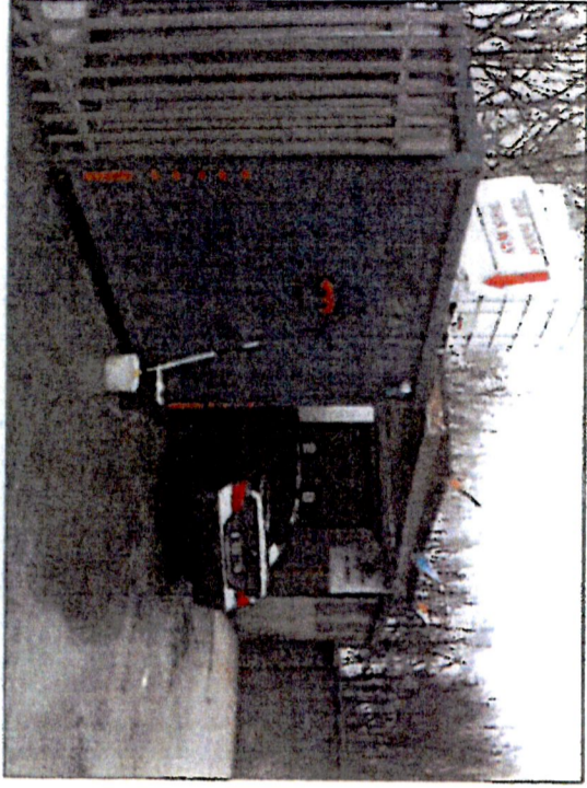
PH2 PORTACABIN OFFICE/CAR WASH AREA