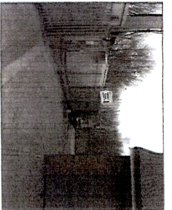
PH3 ACCESS TO CAR WASH AREA