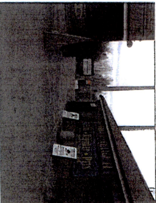
PH4 ENTRANCE TO CAR WASH AREA