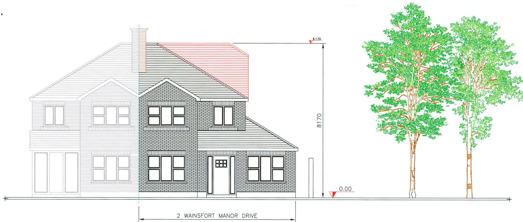
PROPOSED FRONT ELEVATION - CONTIGUOUS