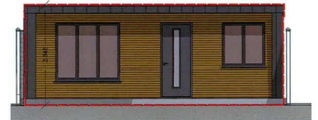
Proposed front elevation (Garden room)