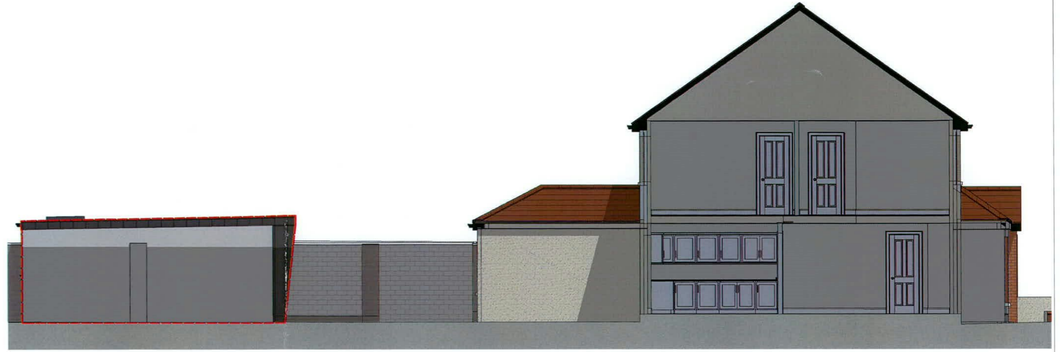
Proposed side elevation