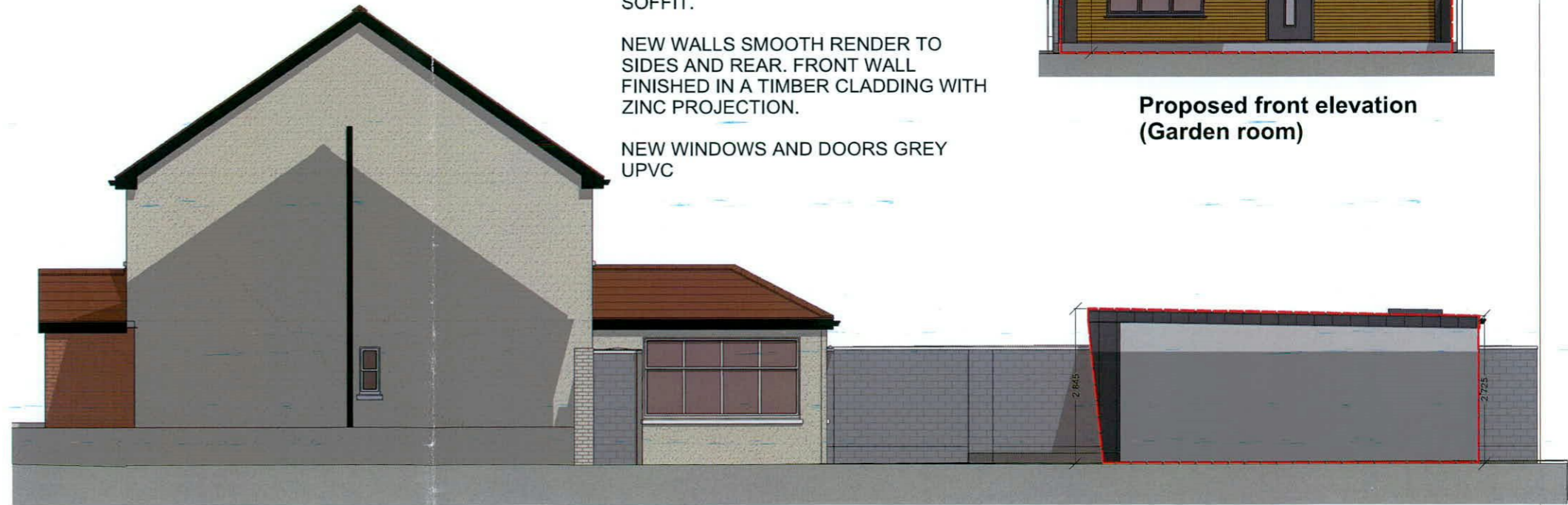
Proposed side elevation