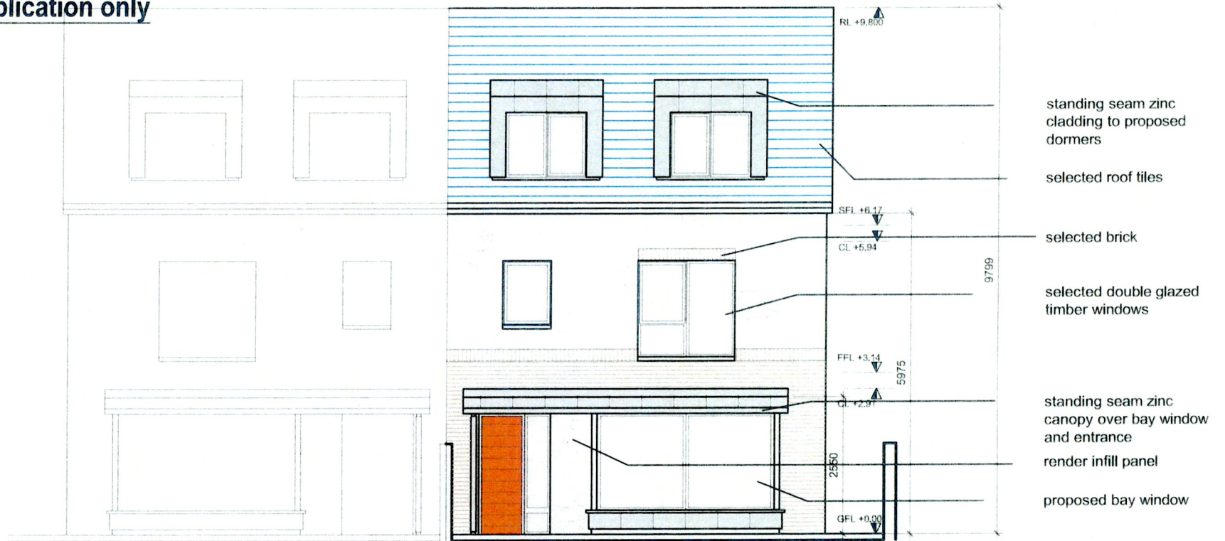
north elevation - 1:100@A3