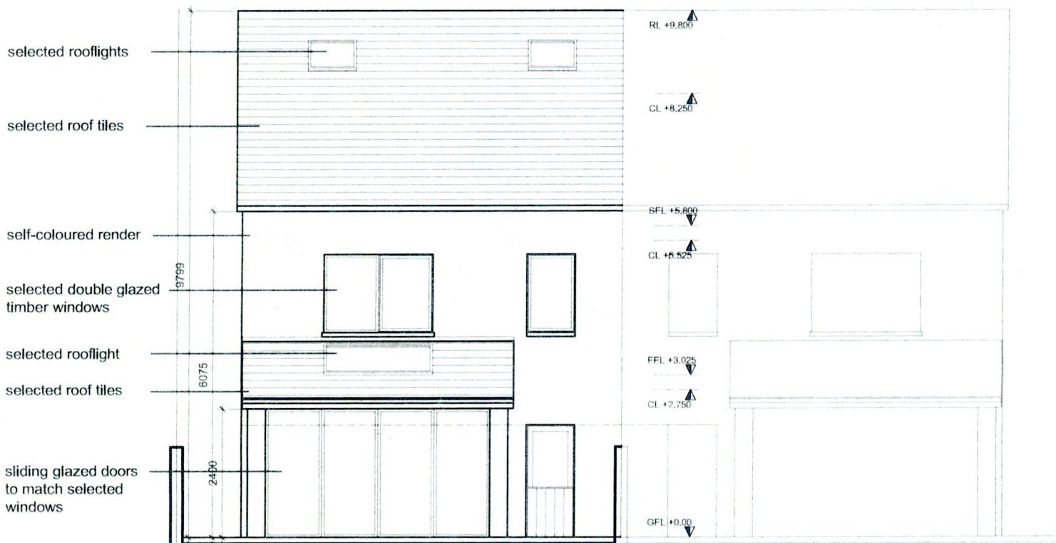
south elevation - 1:100@A3