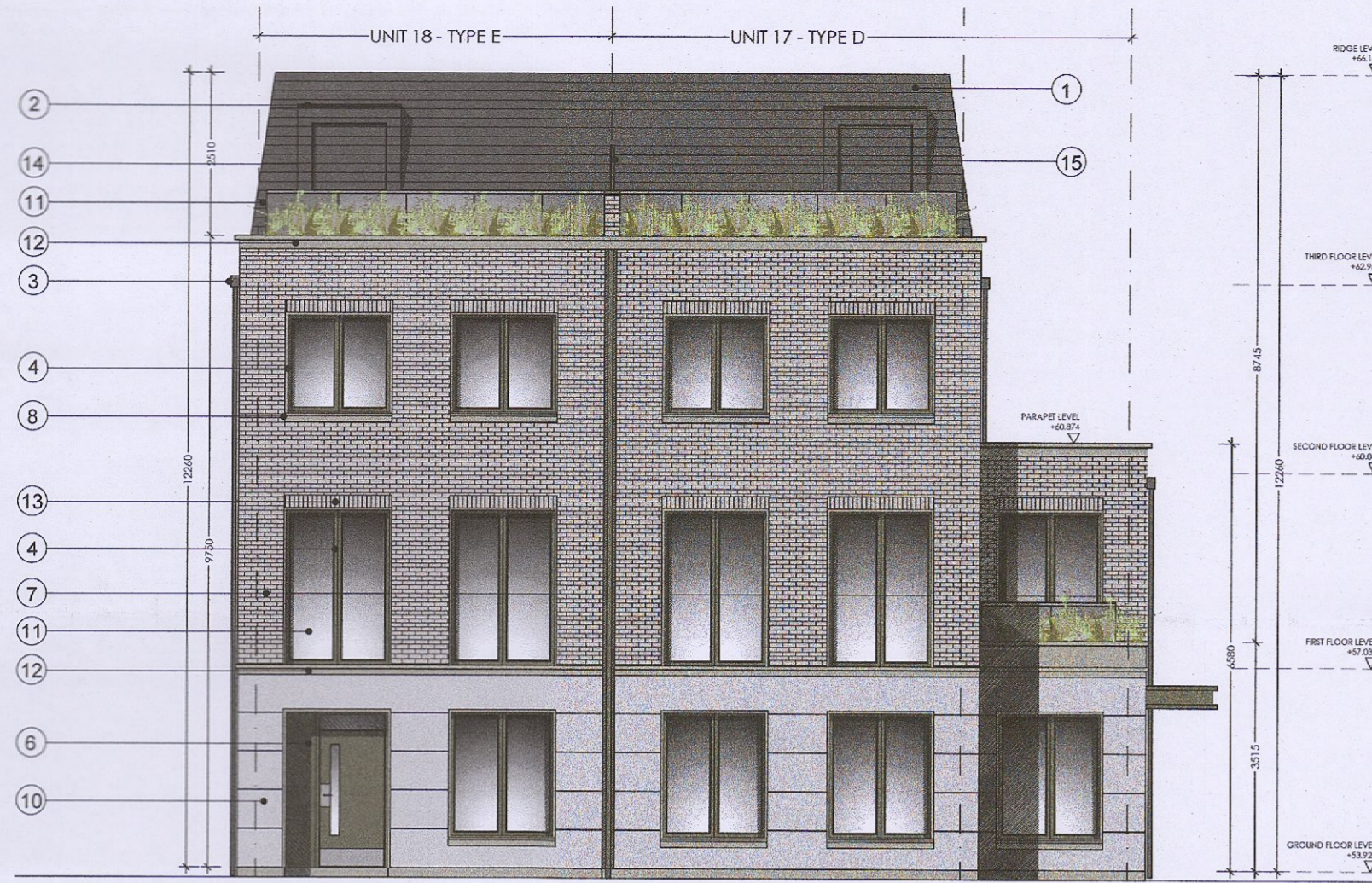
PROPOSED FRONT/ SOUTH FACING ELEVATION - SCALE 1:100