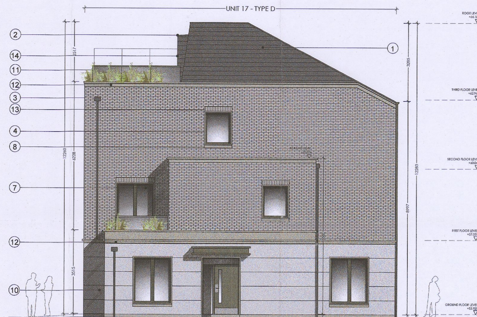
PROPOSED SIDE/ EAST FACING ELEVATION - SCALE 1:100