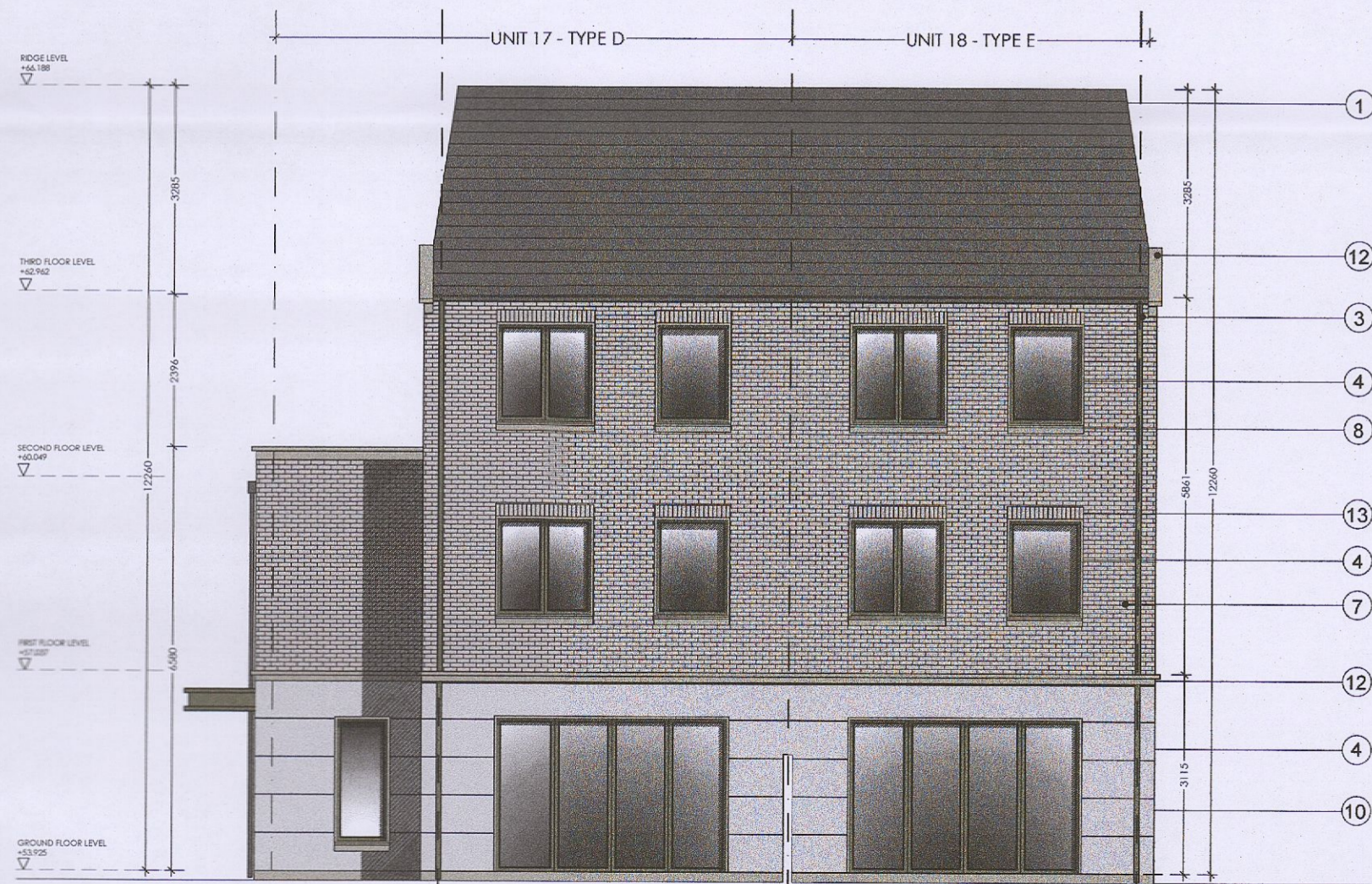
PROPOSED REAR/ NORTH FACING ELEVATION - SCALE 1:100