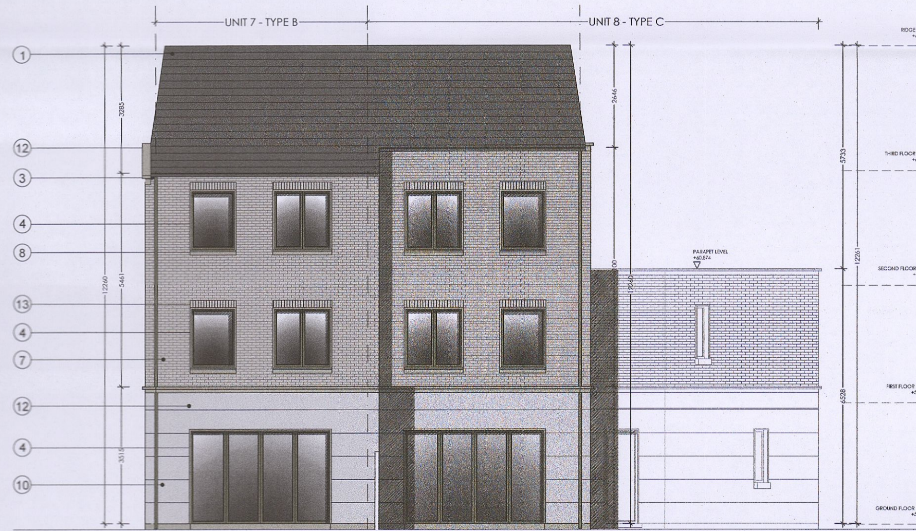
PROPOSED REAR/ SOUTH FACING ELEVATION - SCALE 1:100