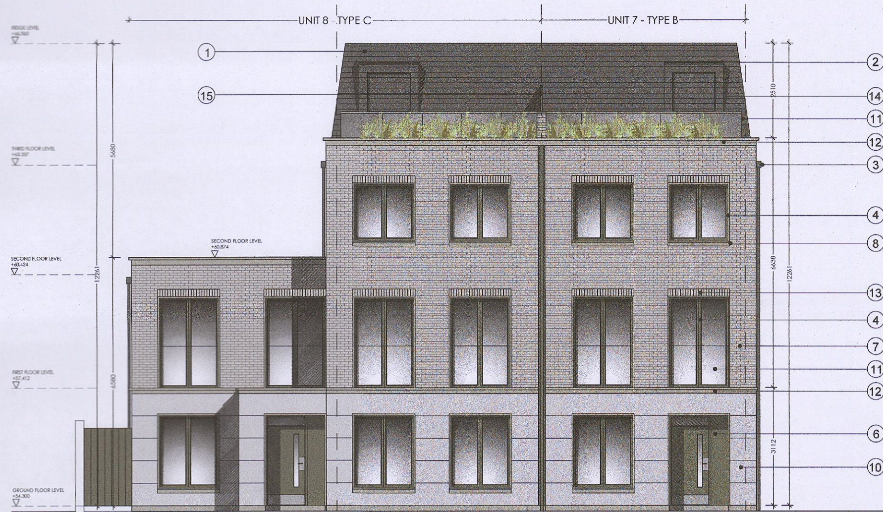
PROPOSED FRONT/ NORTH FACING ELEVATION - SCALE 1:100