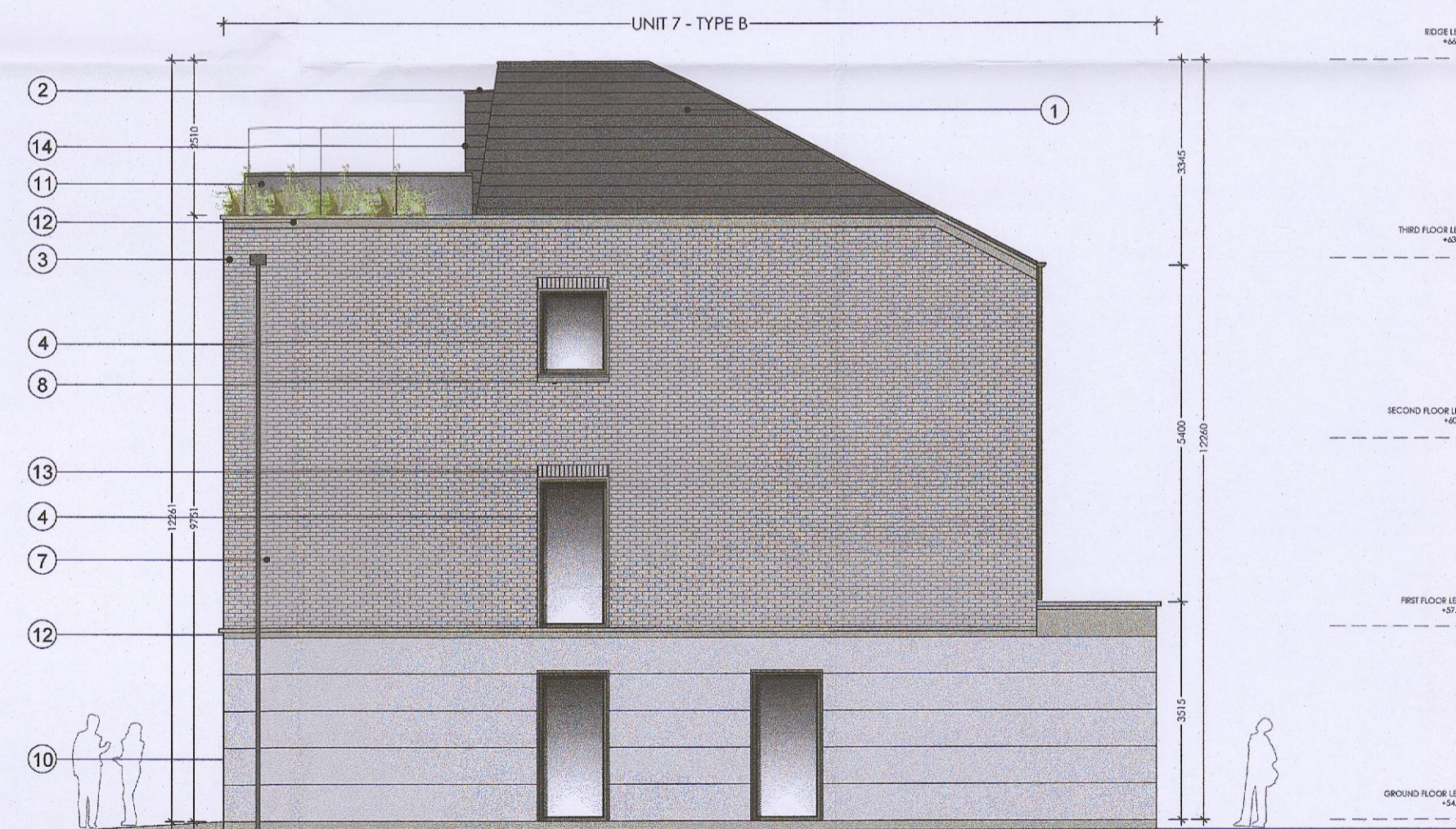
PROPOSED SIDE/ EAST FACING ELEVATION - SCALE 1:100