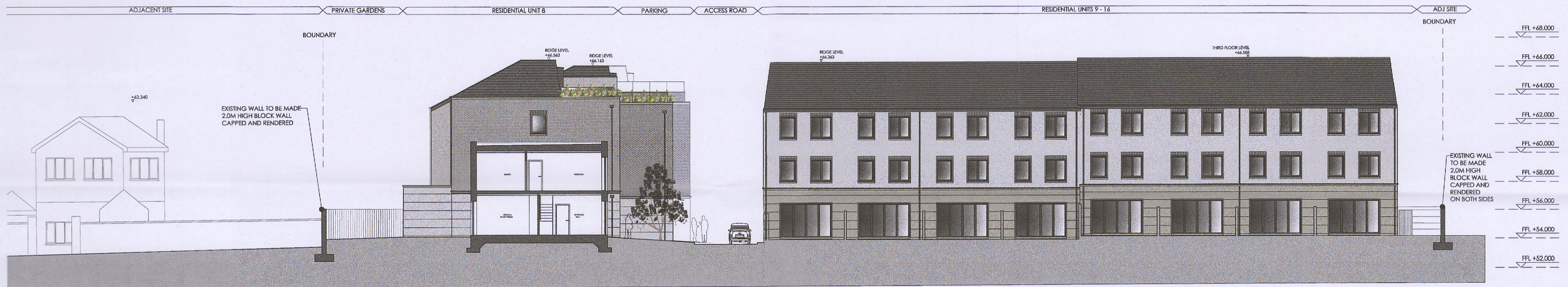
PROPOSED SECTION 4:4 1:200