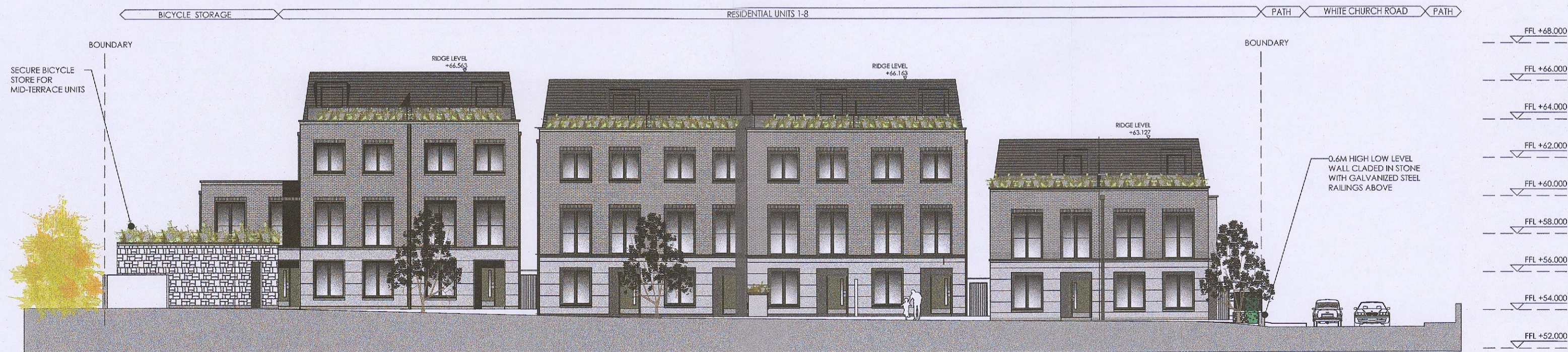
PROPOSED SECTION 5:5 1:200

DO NOT SCALE OFF THIS DRAWING. ONLY STATED DIMENSIONS ARE TO BE USED. ALL DIMENSIONS TO BE VERIFIED ON SITE BY MAIN CONTRACTOR BEFORE THE COMMENCEMENT OF WORKS.