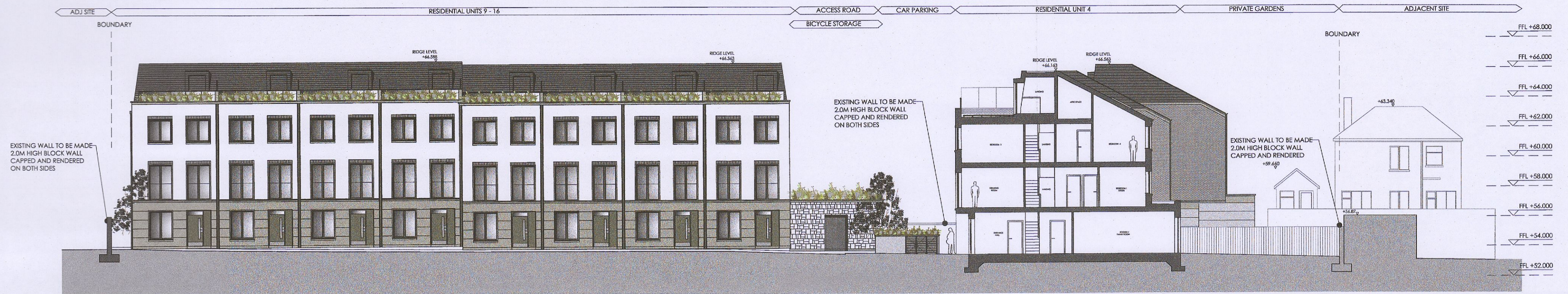
PROPOSED SECTION 2:2 1:200