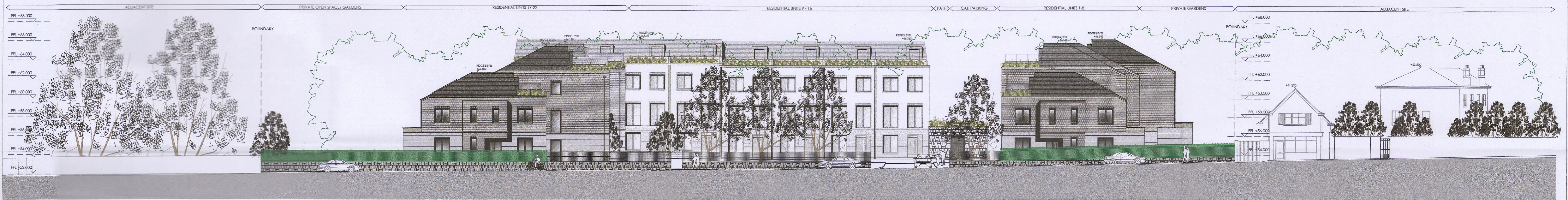
PROPOSED SECTION 1:1 1:200