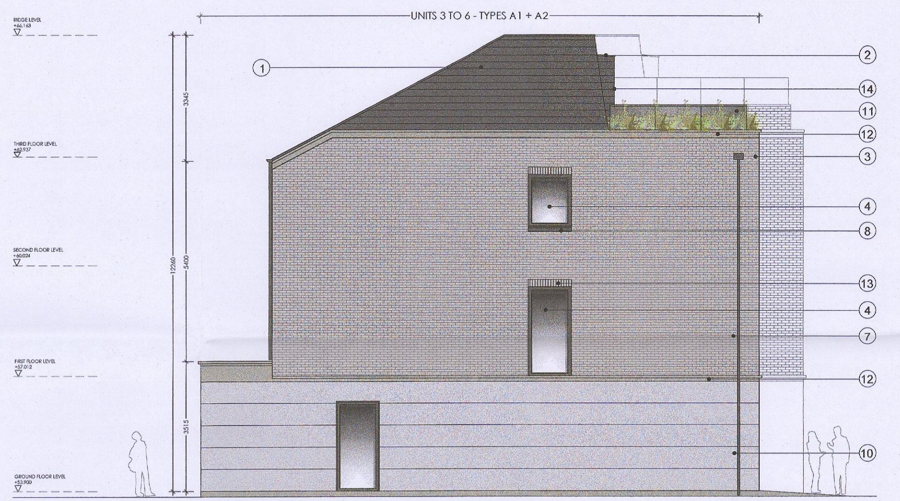
PROPOSED SIDE/ WEST FACING ELEVATION - SCALE 1:100