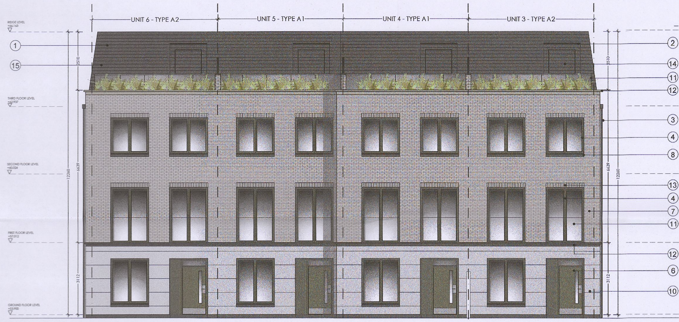
PROPOSED FRONT NORTH FACING ELEVATION - SCALE 1:100