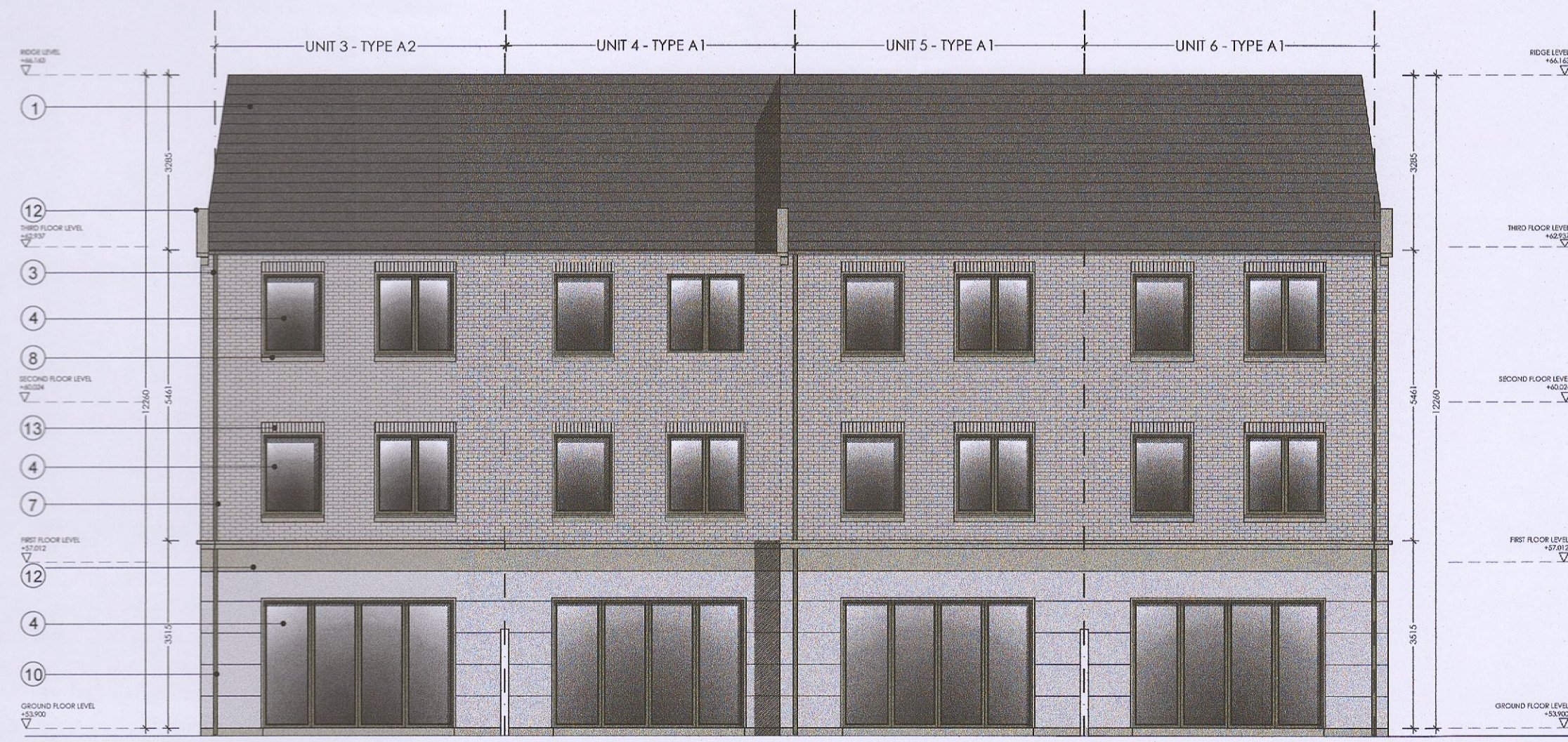
PROPOSED REAR/ SOUTH FACING ELEVATION - SCALE 1:100