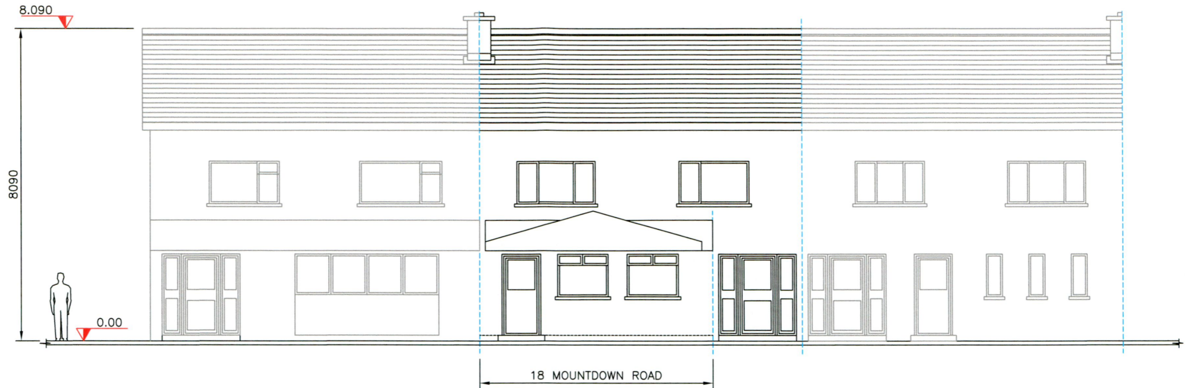
EXISTING FRONT ELEVATION - CONTIGUOUS