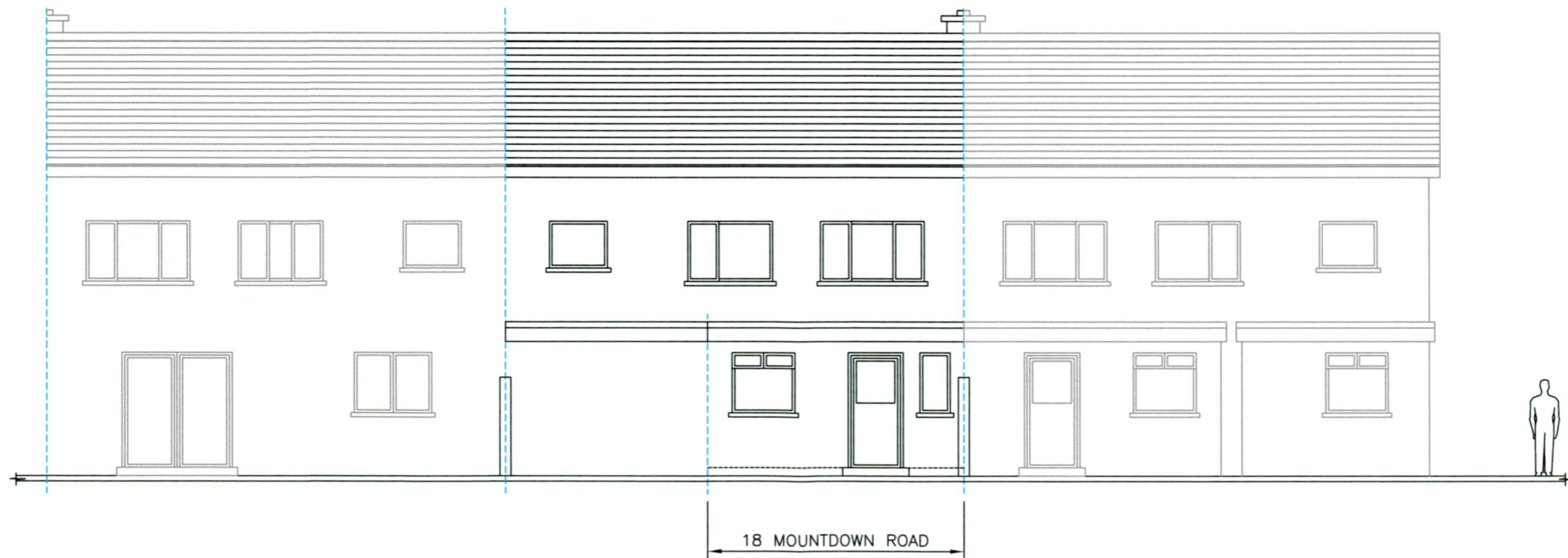
EXISTING REAR ELEVATION - CONTIGUOUS